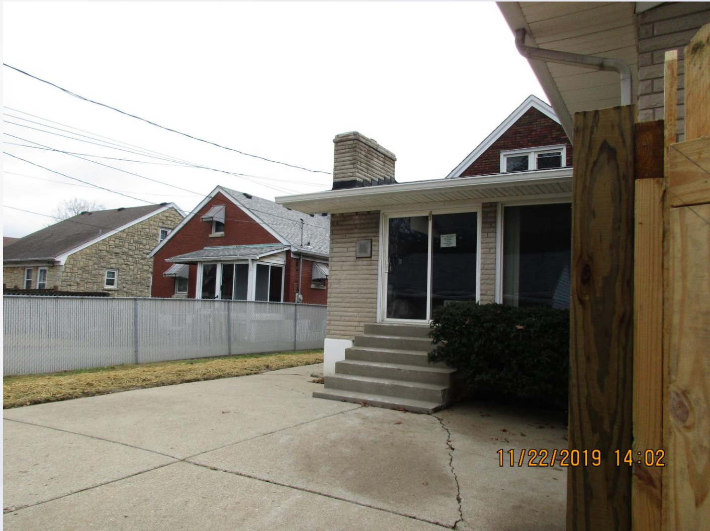
Fenced in area.