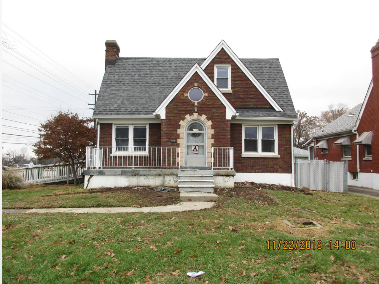
Front of subject property.