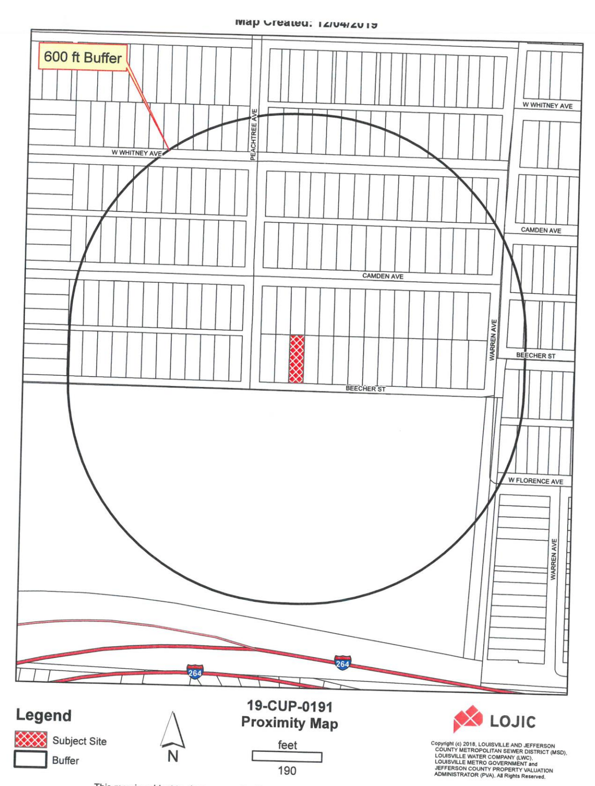
This map is subject to change upon the Board of Zoning Adjustment granting approvals to other Short Term Rental Conditional Use Permits.