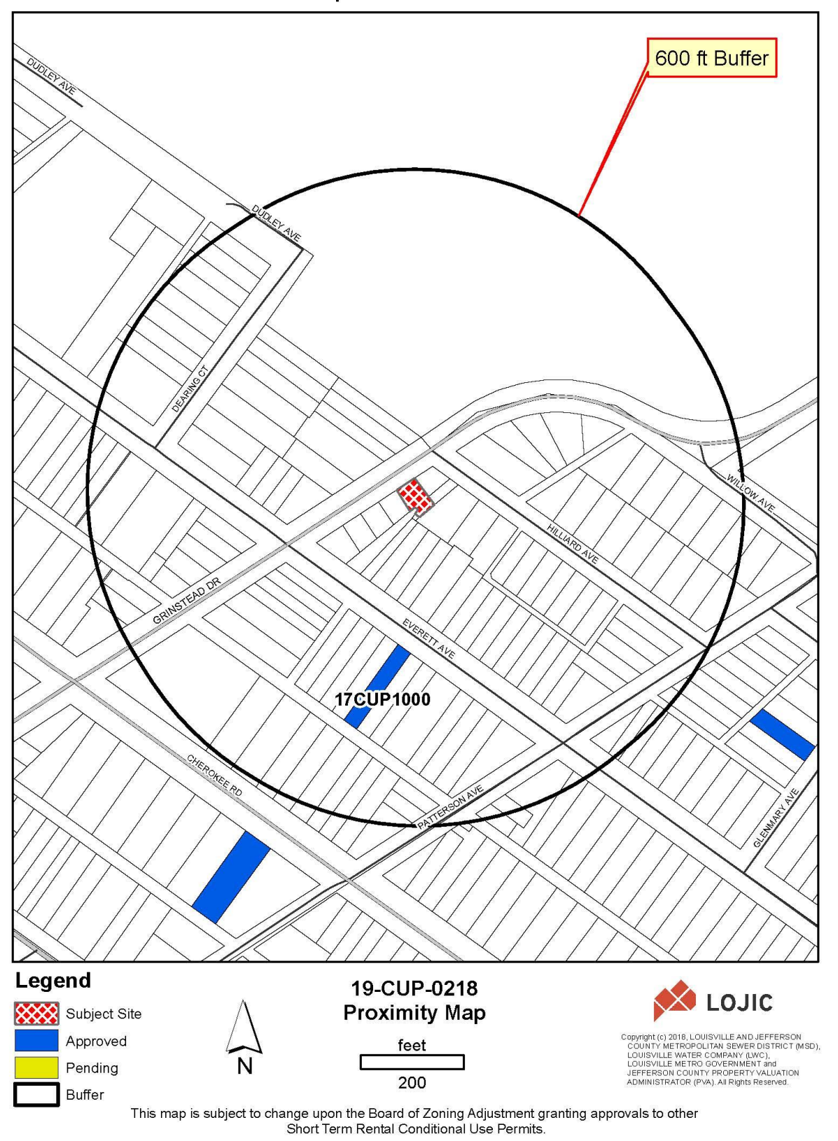
Map Created: 12/20/2019