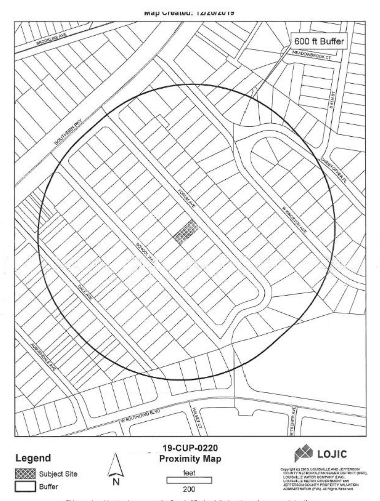
This map is subject to change upon the Board of Zoning Adjustment granting approvals to other Short Term Rental Conditional Use Permits.