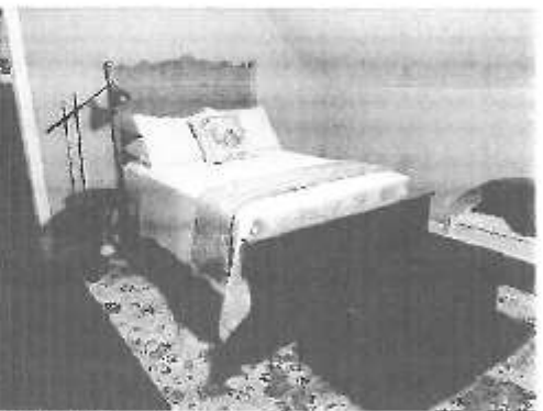
Third Floor Bedroom