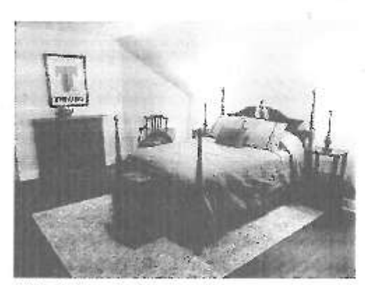
Third Floor Bedroom