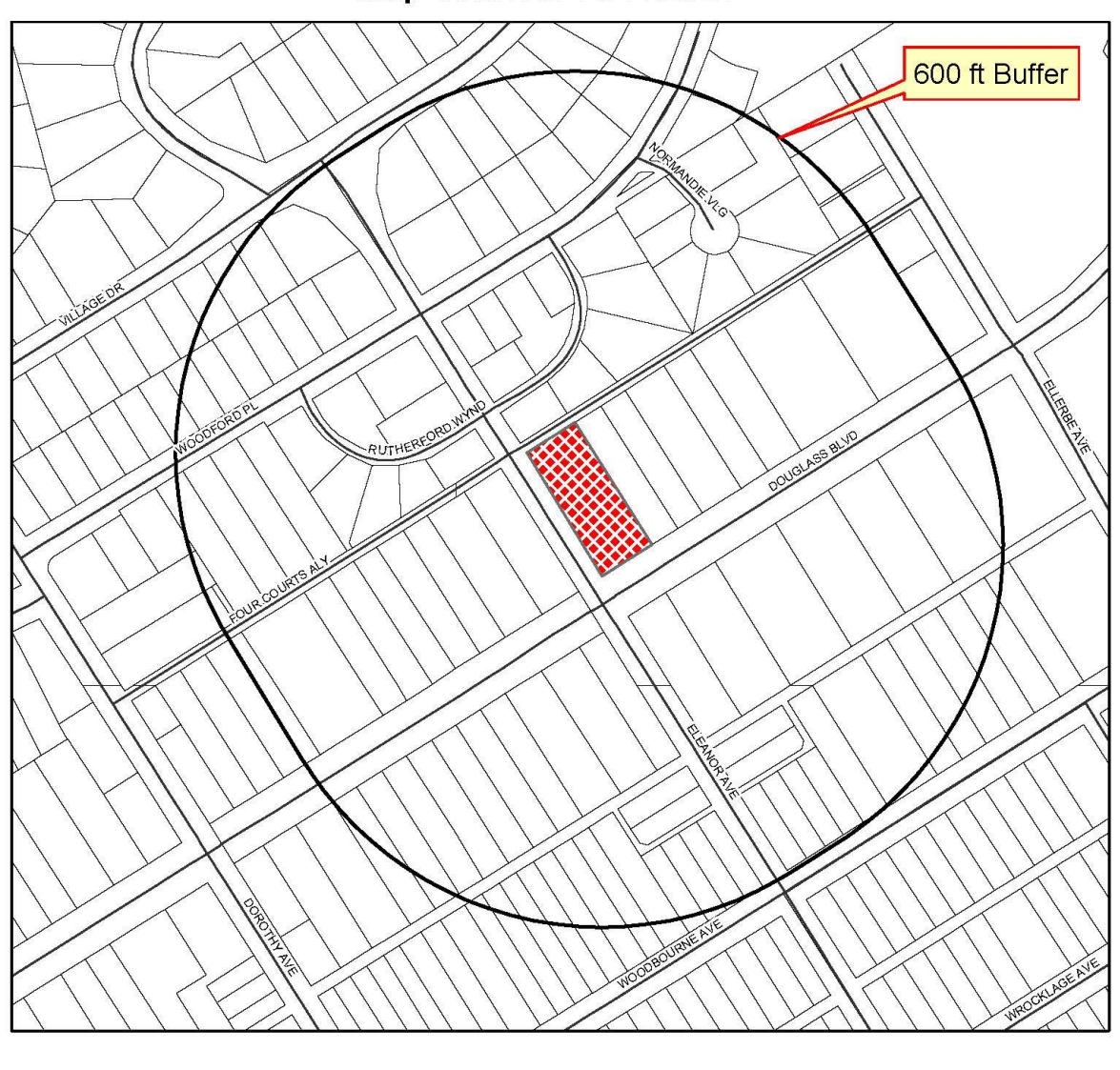
Map Created: 01/08/2020