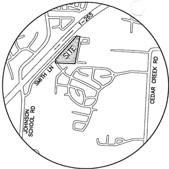
LOCATION MAP NO SCALE