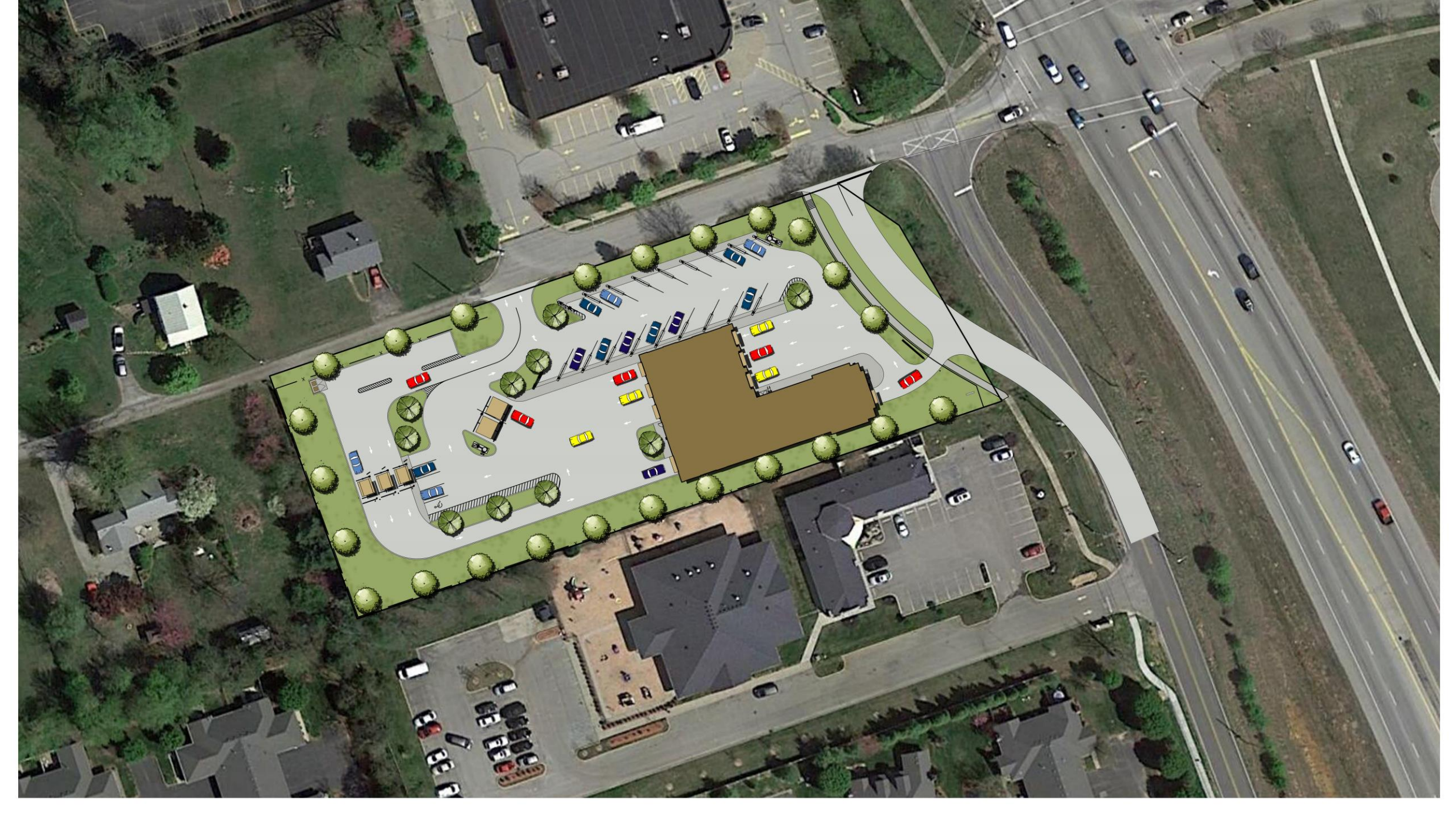
Forn Crook Spoodwach