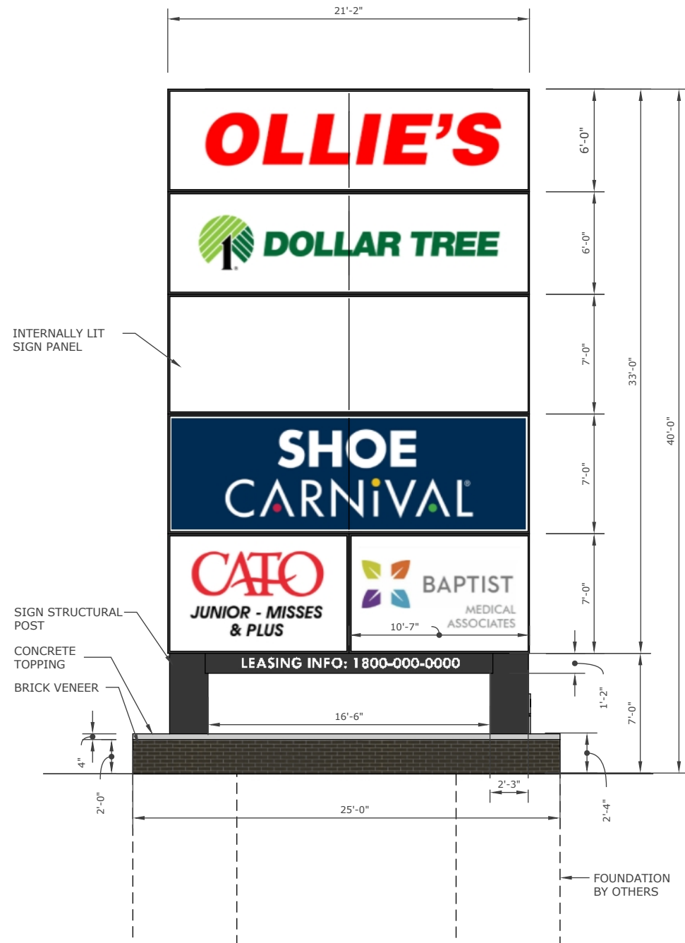
01 FRONT VIEW 1/8" = 1'-0" (1:96)