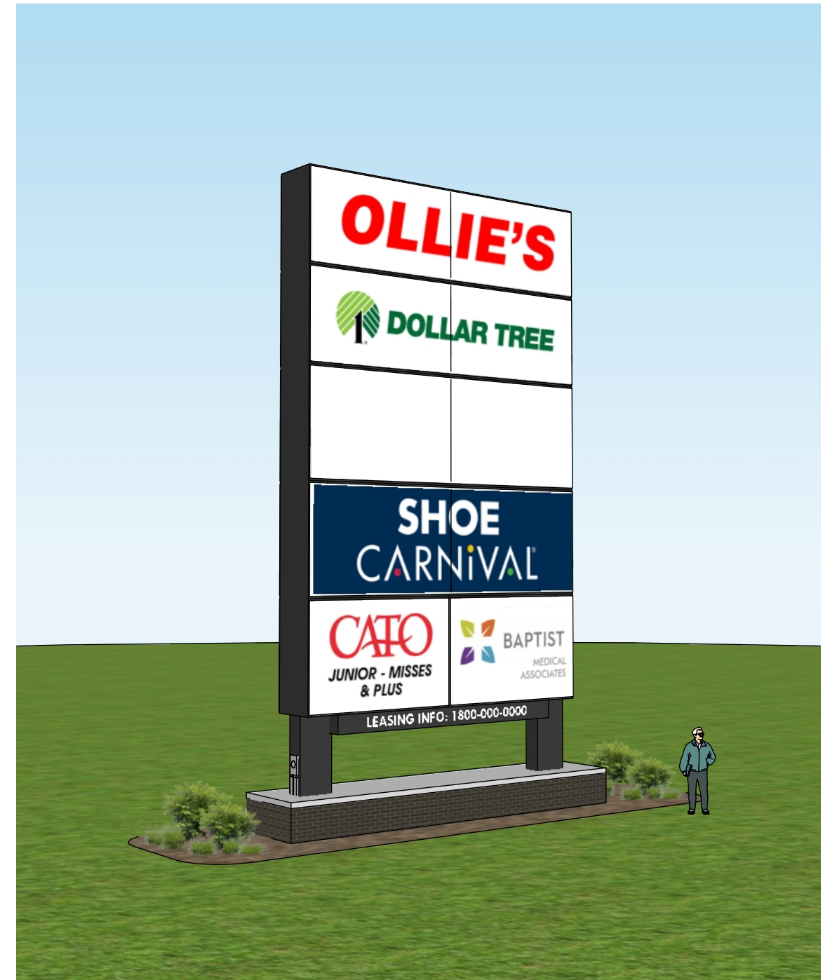
03 PERSPECTIVE Scale: N/A