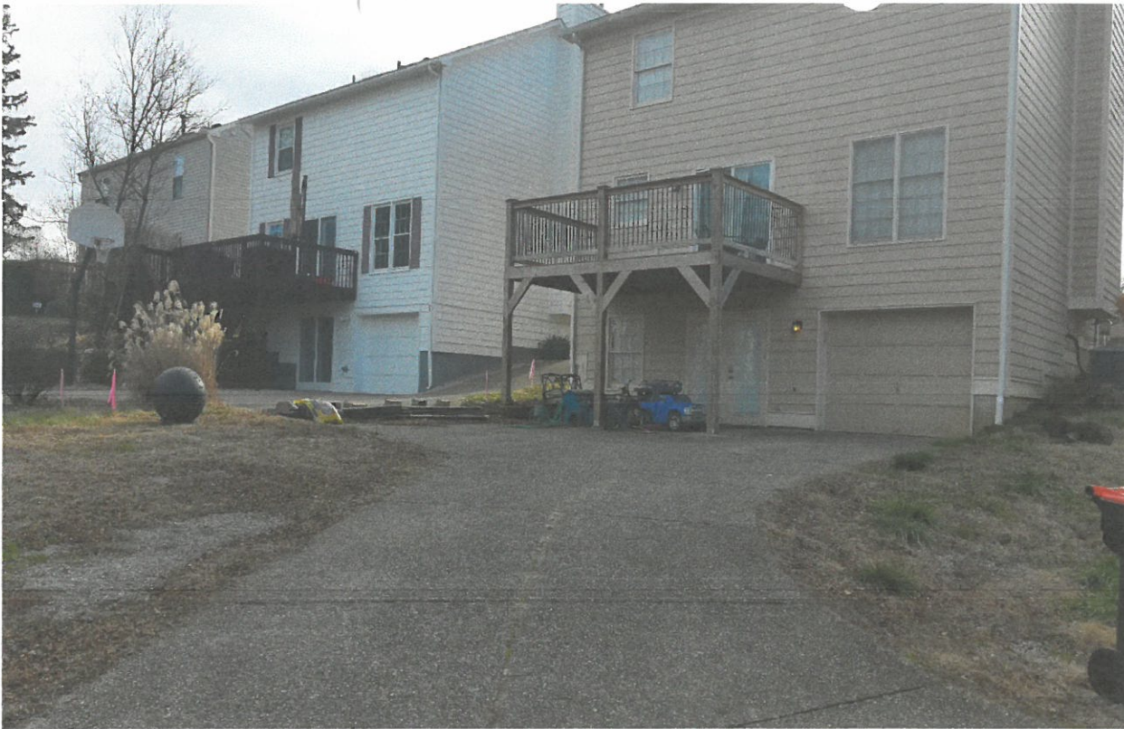
48 Warren Road Right, 46 Warren Road left from the rear. Both have rear basement garages