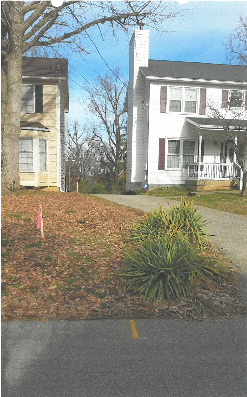
Front view of the house-showing existing normal appearing driveway access for 46 Warren Road. This is the new property line marked