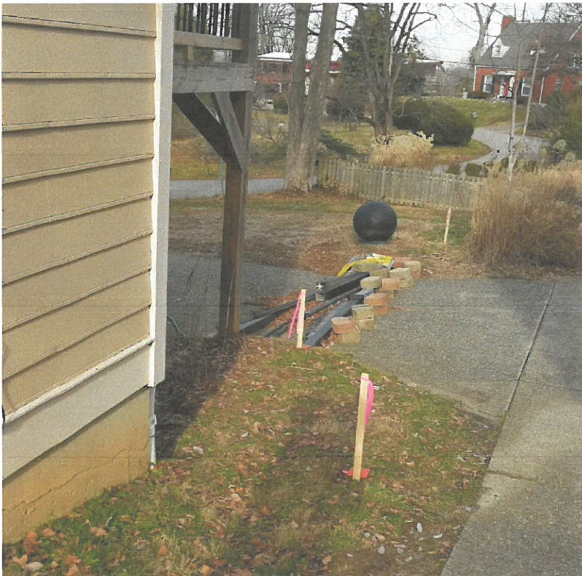
Proposed new property line marked. Existing Barrier

RECEIVED JAN 13 2011 PLANNING & DESIGN SERVICE