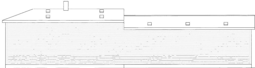
NORTH ELEVATION SIDE OF HOUSE - FACING NEIGHBOR