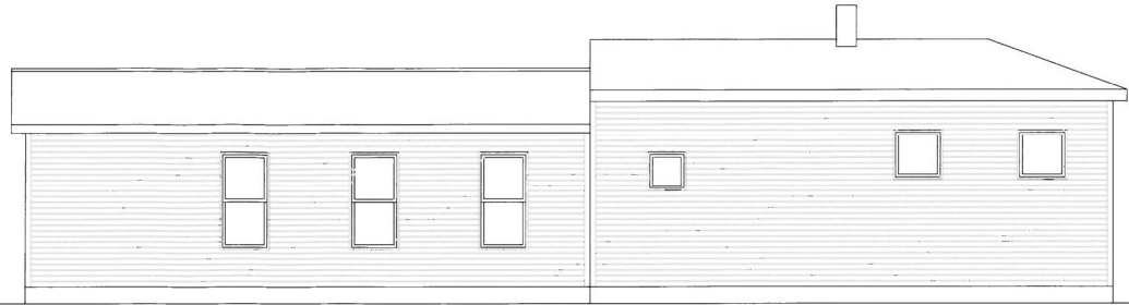
SOUTH ELEVATION SIDE OF HOUSE - FACING STREET