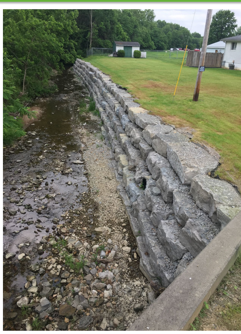
Mitchell Hill Road