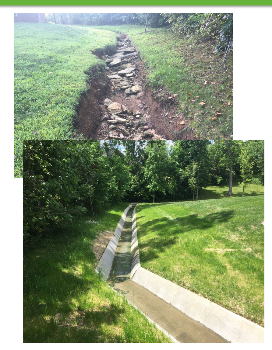
Before & after Glenmary Springs