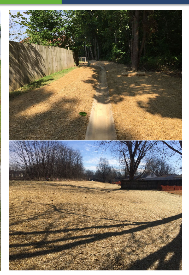
Top: Ashbrook Gardens Drive Bottom: John Adam Parkway