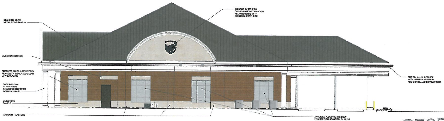
WEST ELEVATION 3/16" = 1'-0"