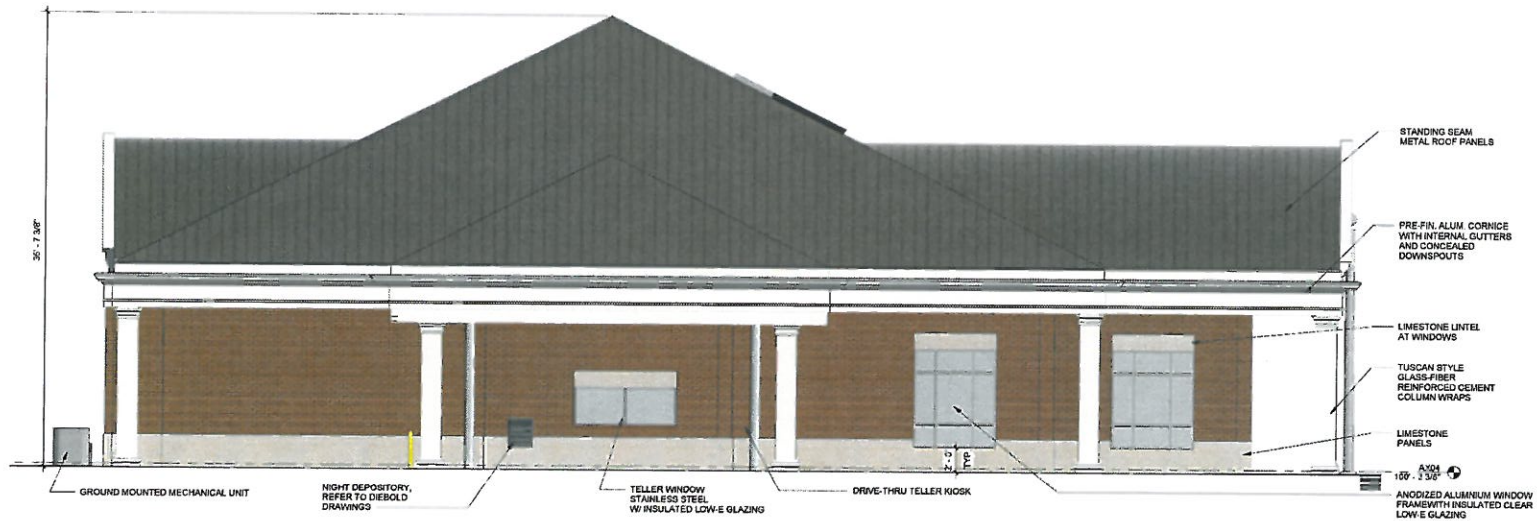
SOUTH ELEVATION 3/16" = 1'-0"