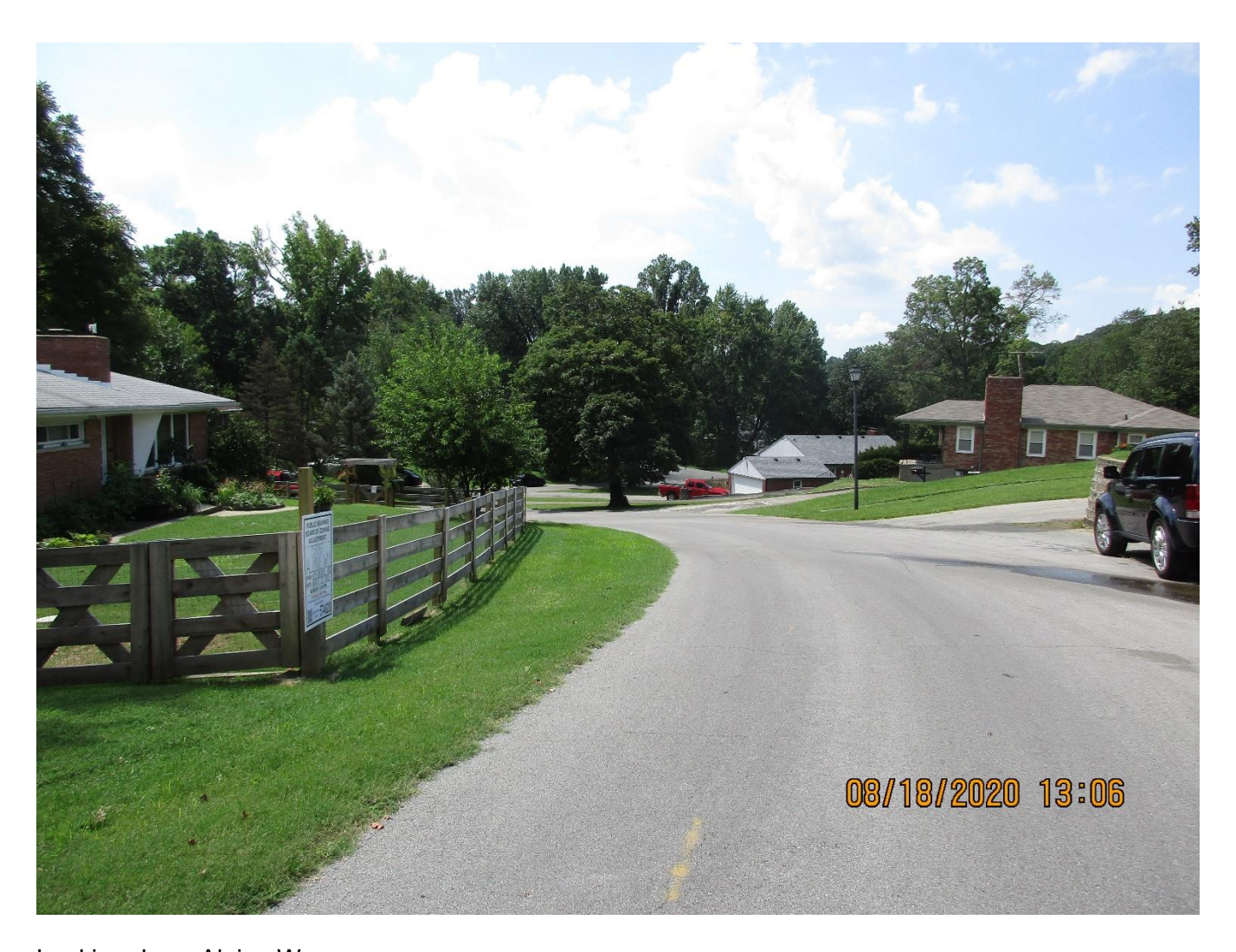
Looking down Alpine Way.