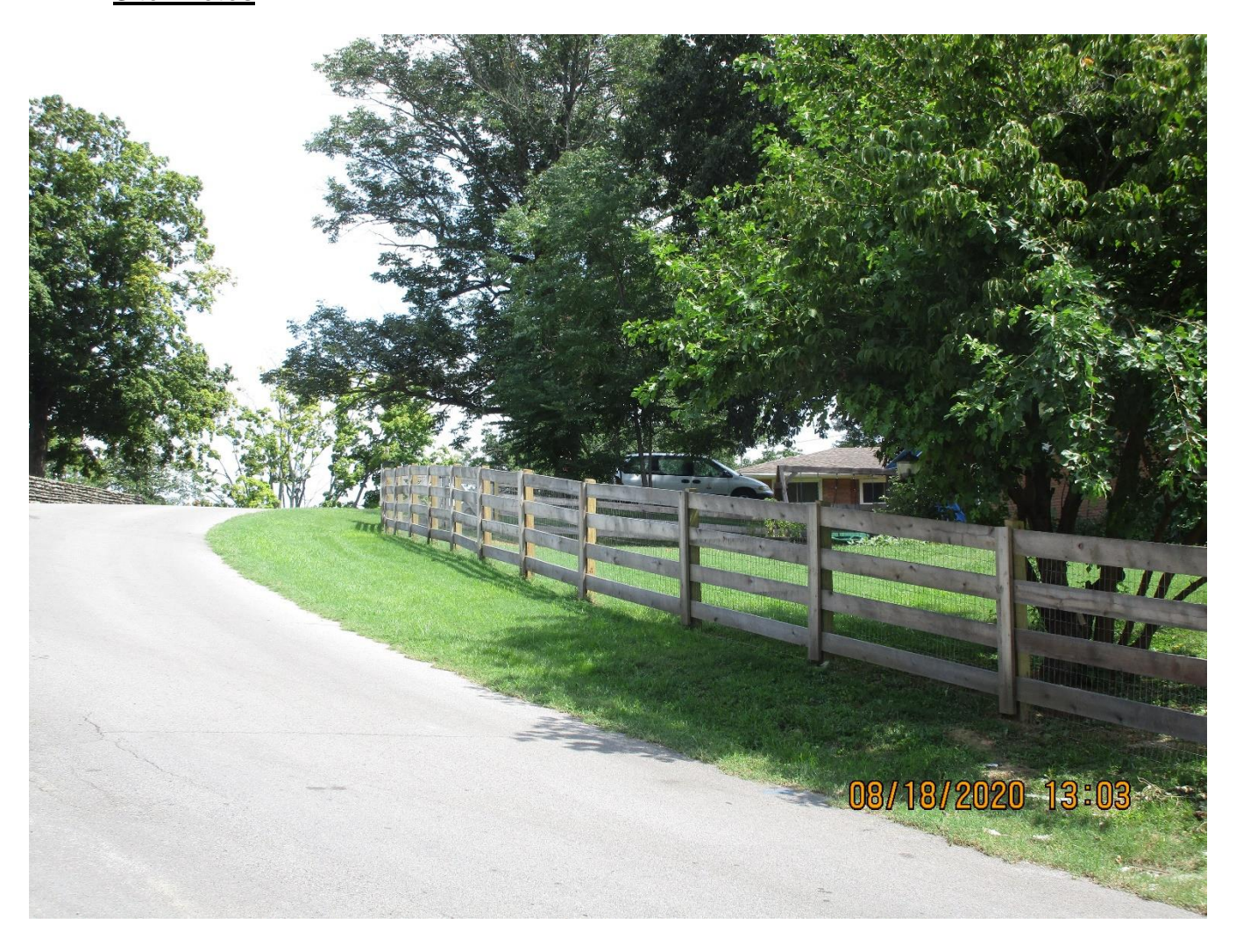
Fence along Alpine Way within the street side yard setback.