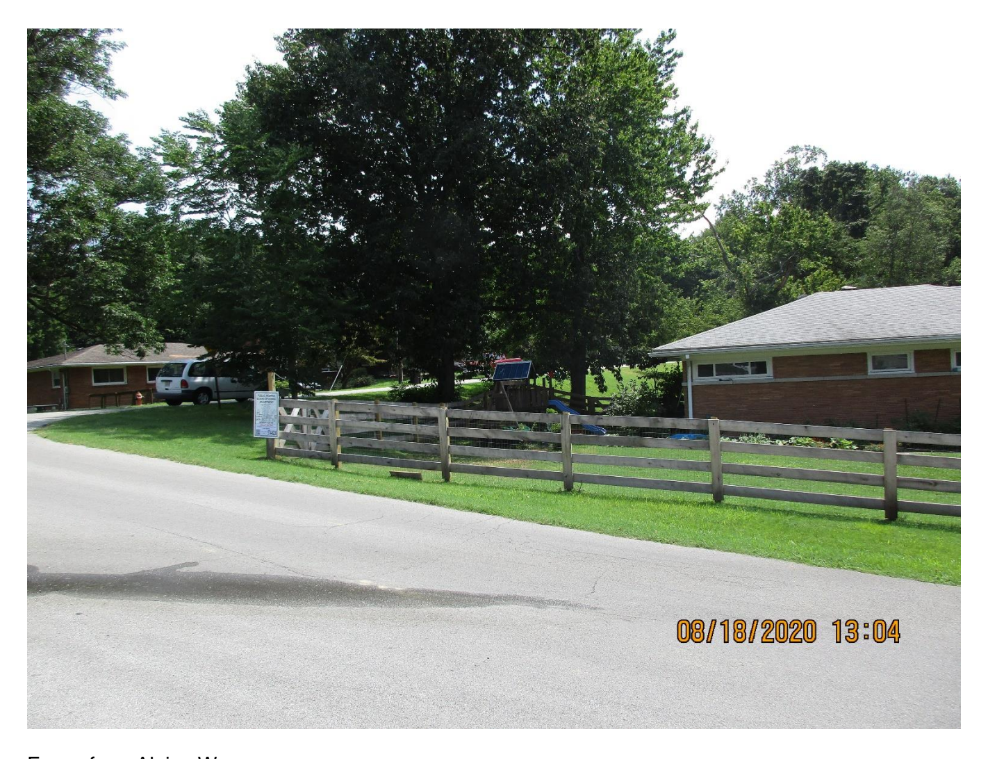
Fence from Alpine Way.