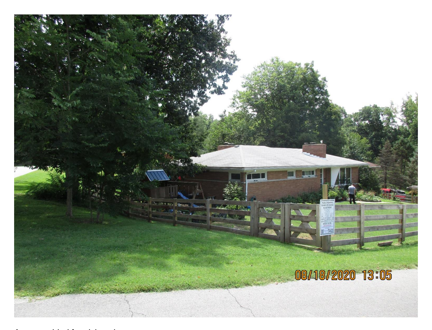
Area provided for vision clearance.