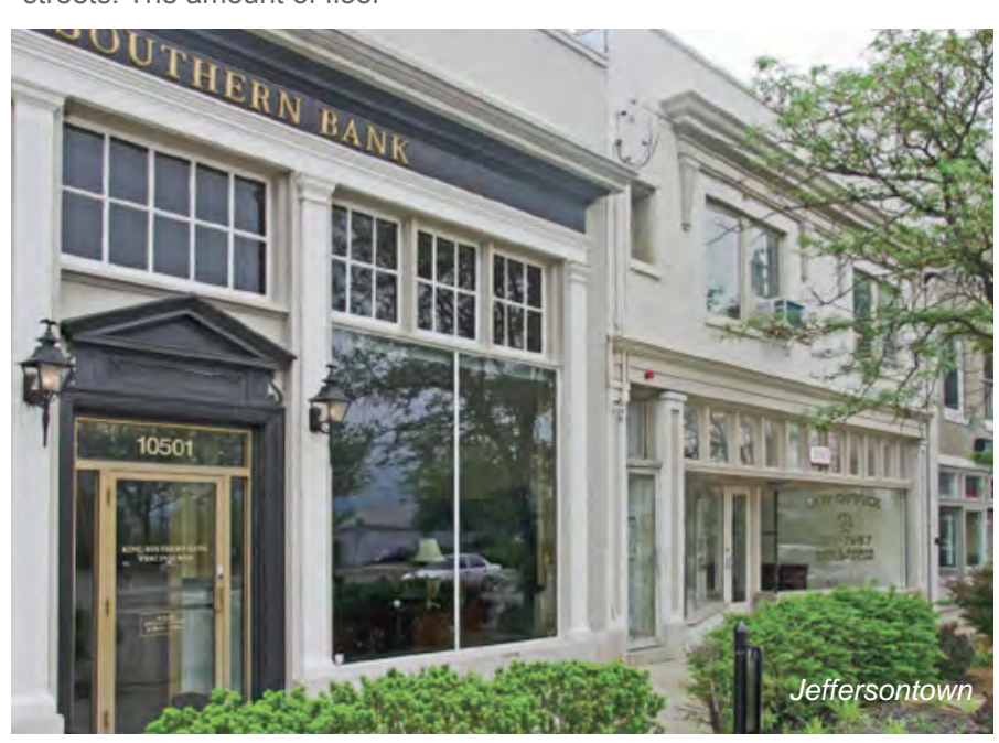
42 | Plan 2040: Comprehensive Plan for Louisville/Jefferson County

The Town Center should have a high level of pedestrian, roadway, transit and bicycle access, a connected street pattern, shared parking and pedestrian amenities.