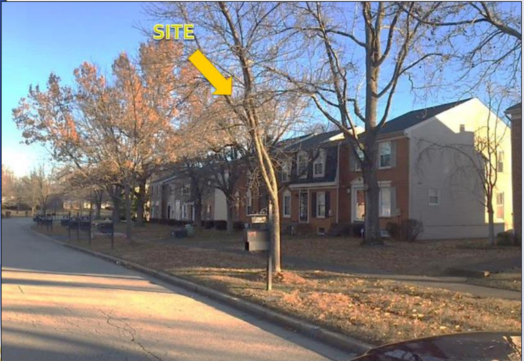
Savannah Row Condos immediately adjacent to site to the west