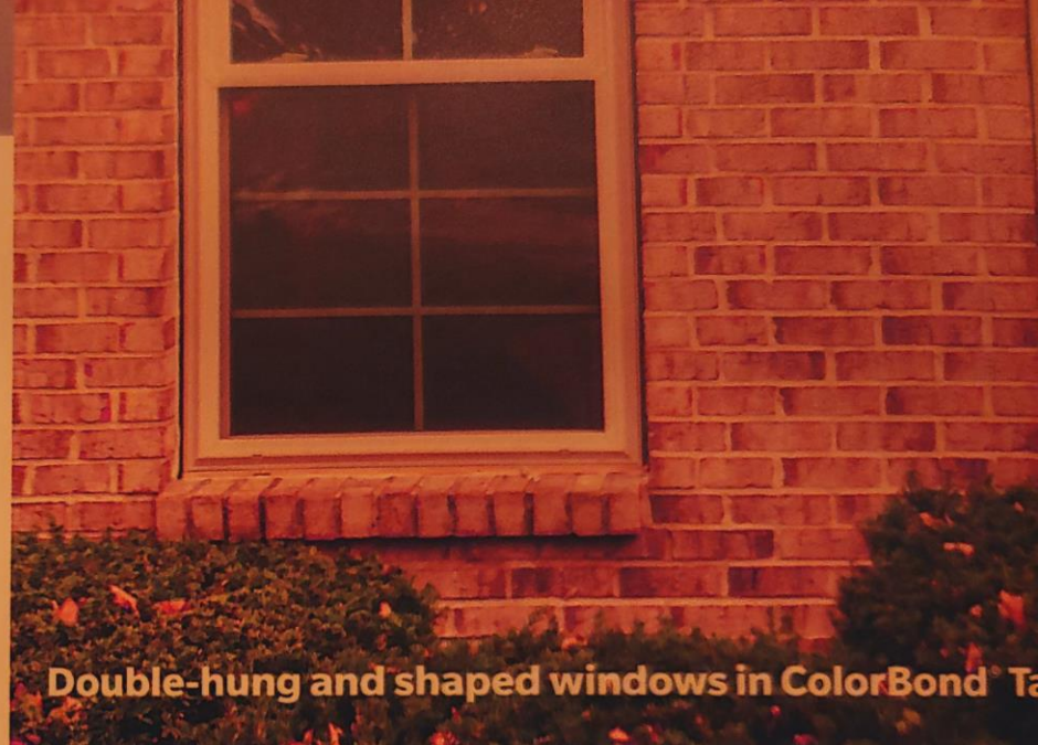
Double-hung and shaped windows in ColorBond® Tan