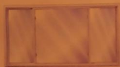
Slider with Fixed Center