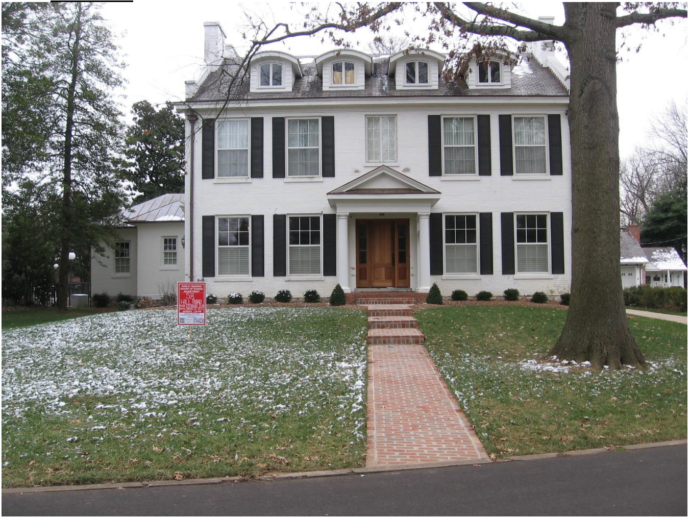
Front of subject property.