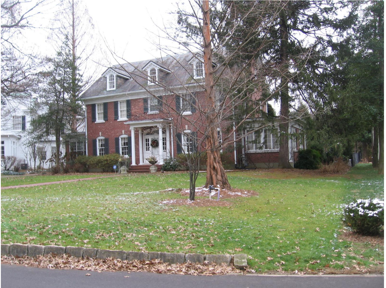
Property to the left.