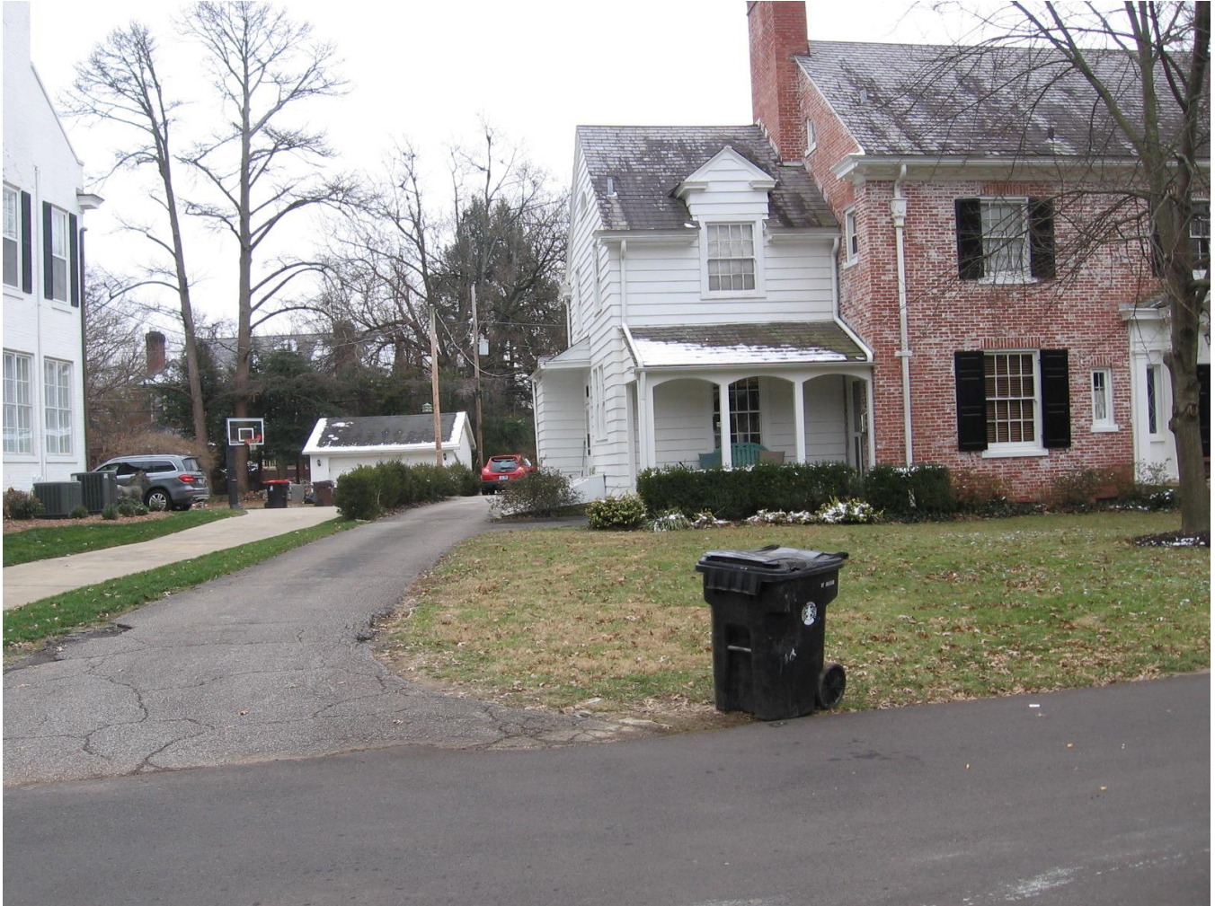
Property to the right.