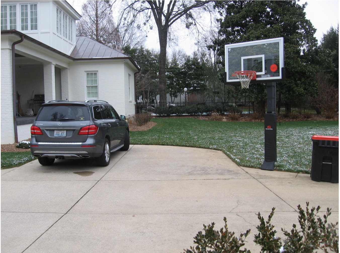
Existing private yard area.