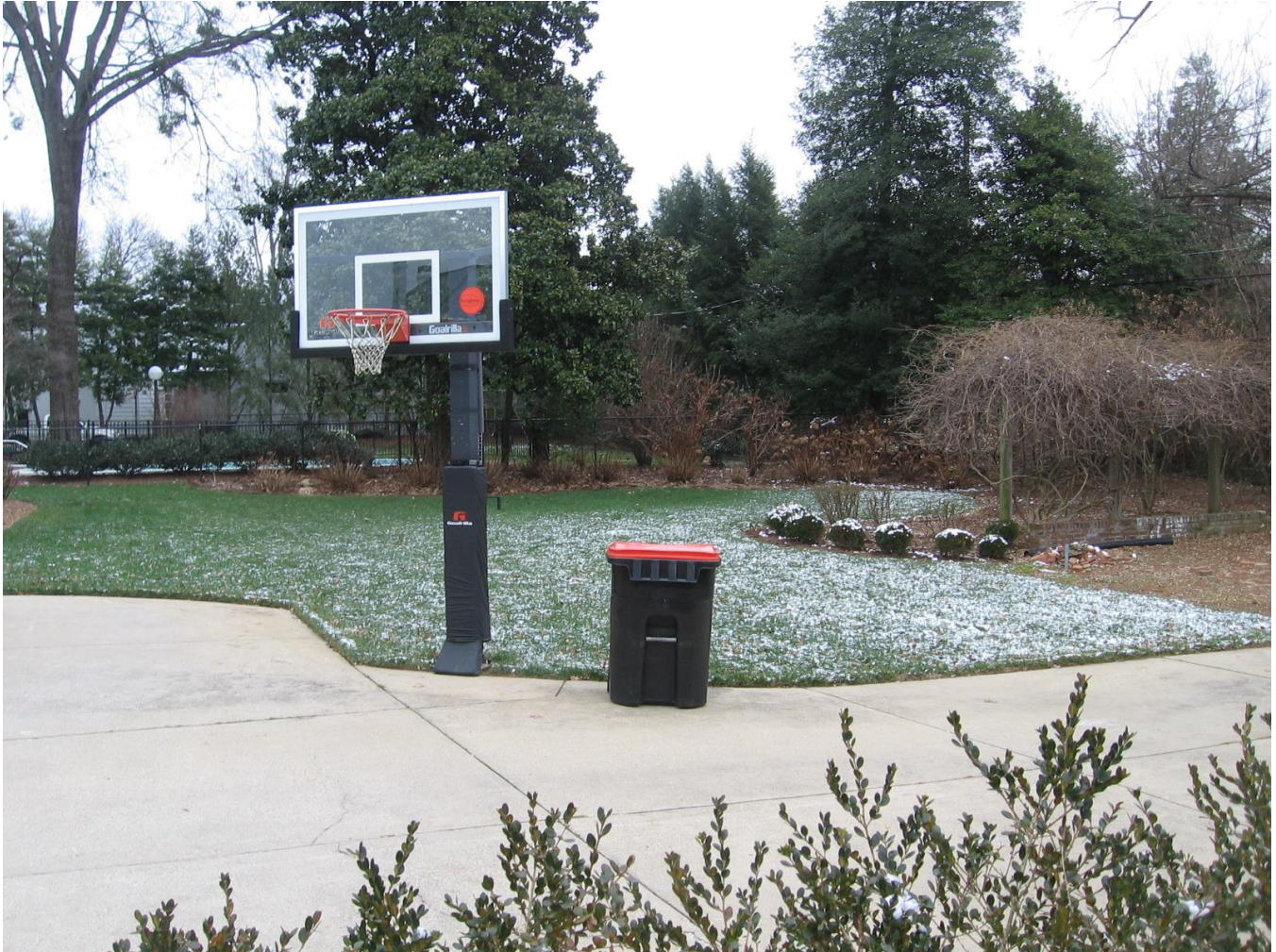
Existing private yard area.