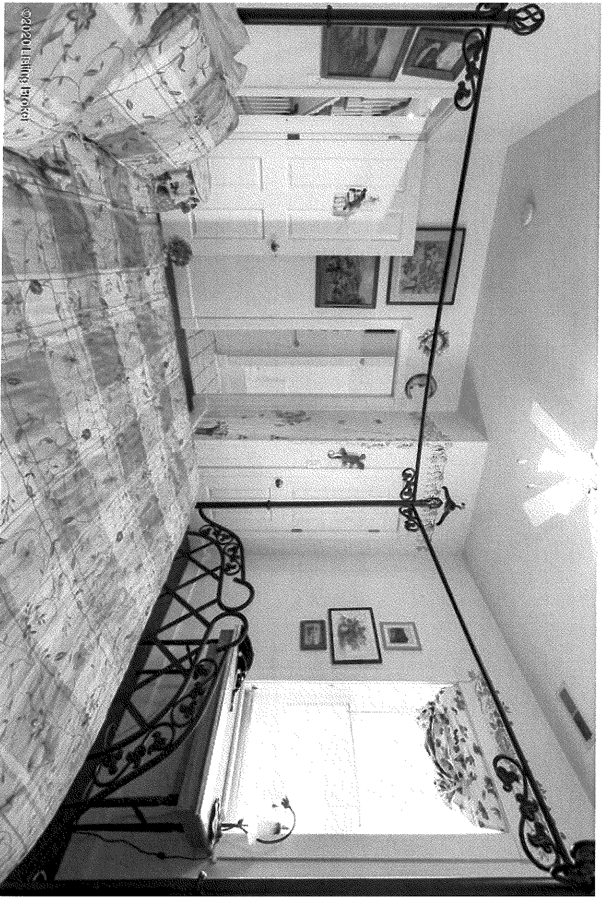
2nd floor Bedroom