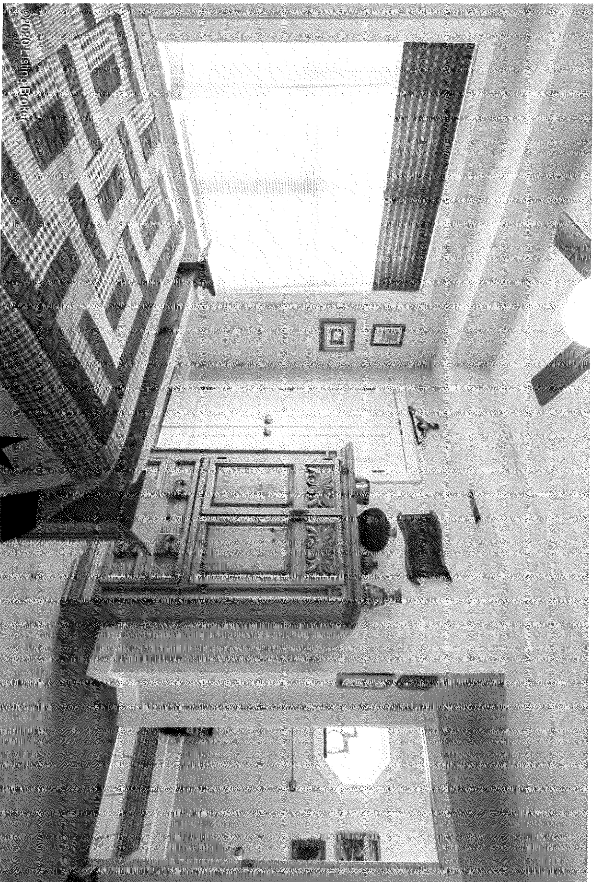
2nd floor Bedroom