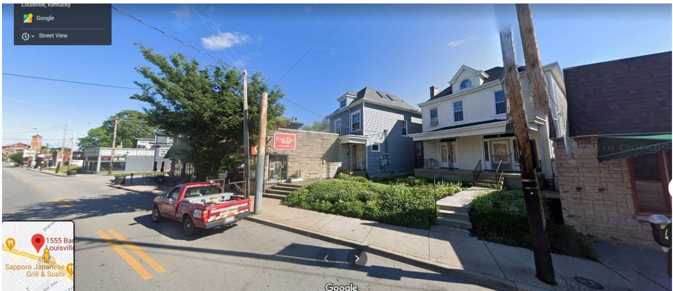
Bardstown Rd south from the subject property