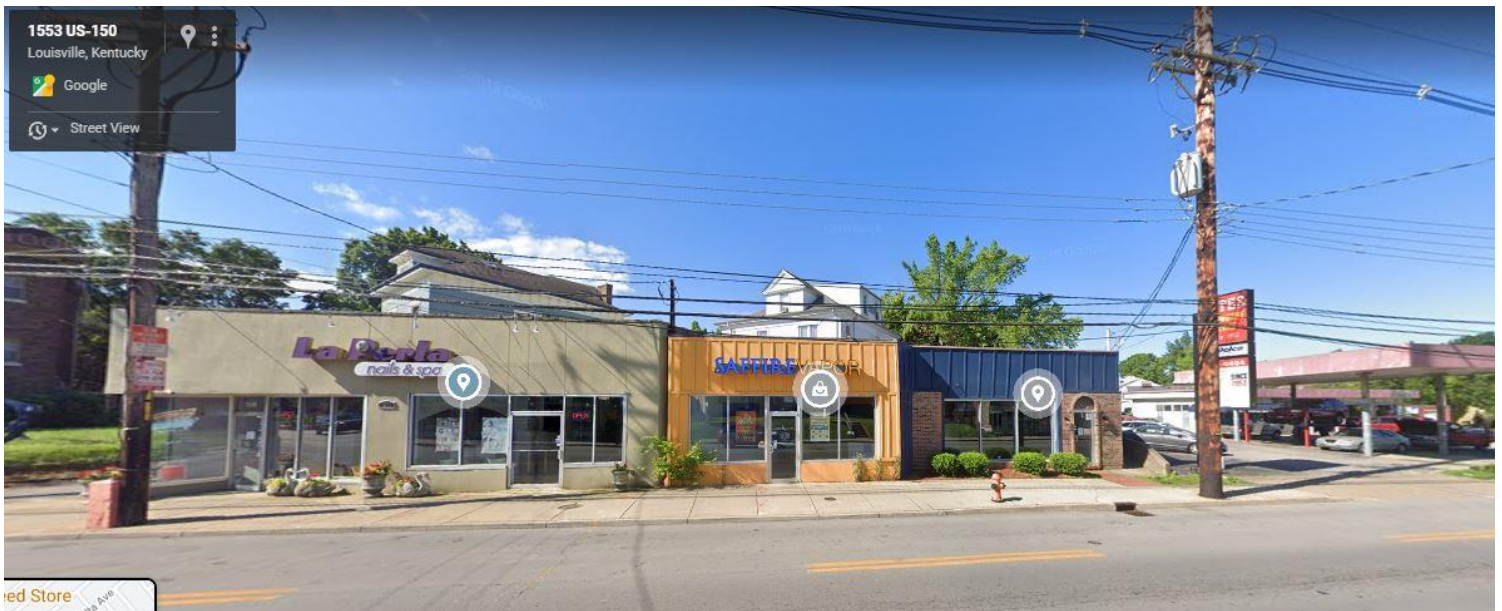
Across the street from the subject property