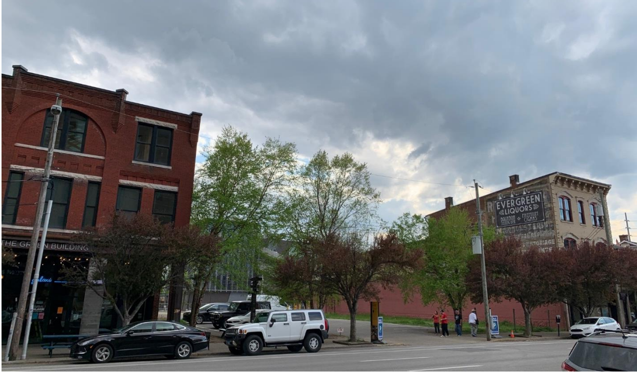
Subject site and adjacent buildings looking southwest