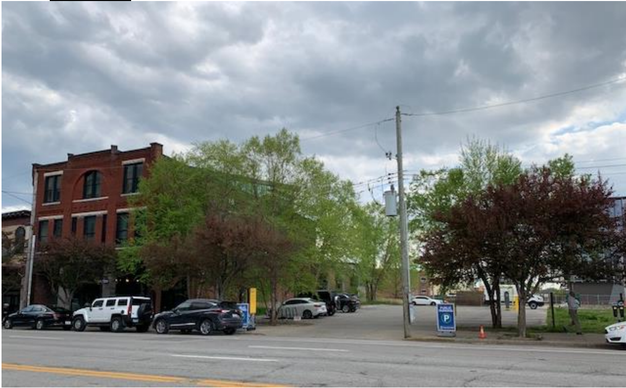
726, 728, 730, and 730R E Market Street