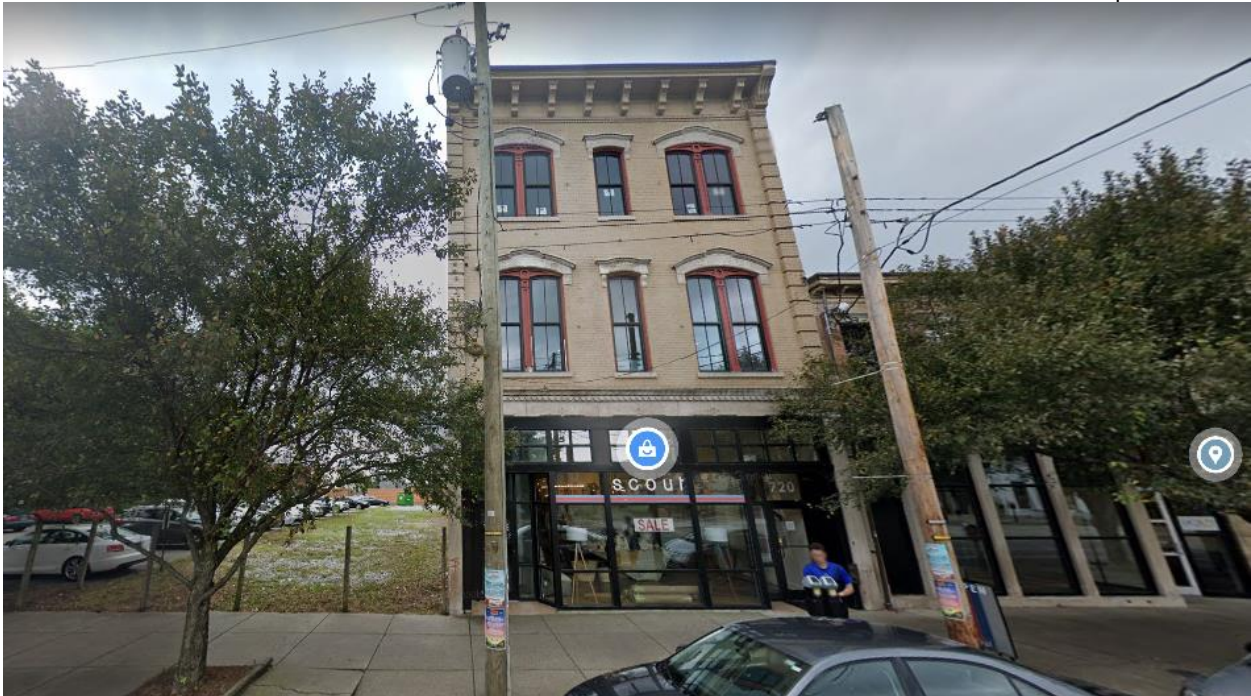
Adjacent building at 720 E Market Street Google street view 2019