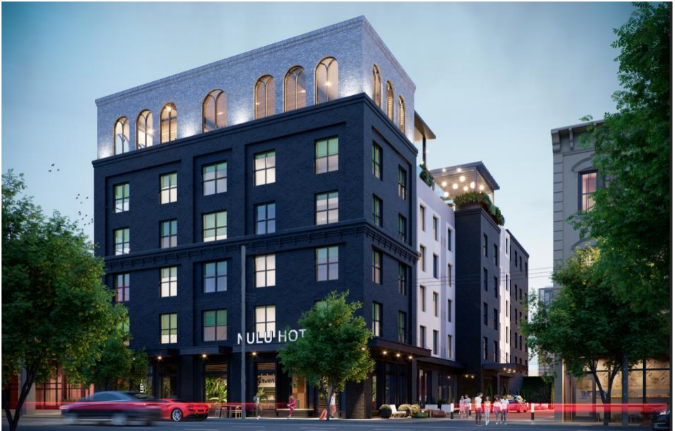
Proposed new 6-story hotel at 730 E Market Street