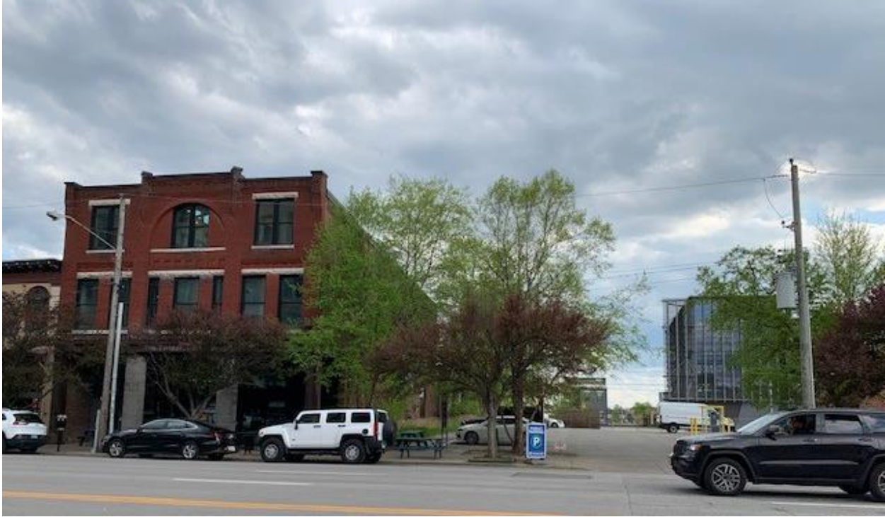
The Green Building, 732 E Market, and the subject site