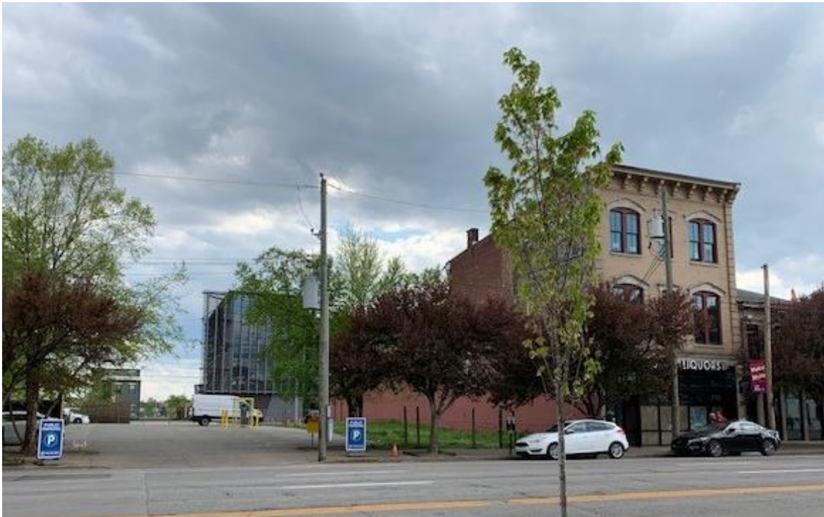
724 E Market Street