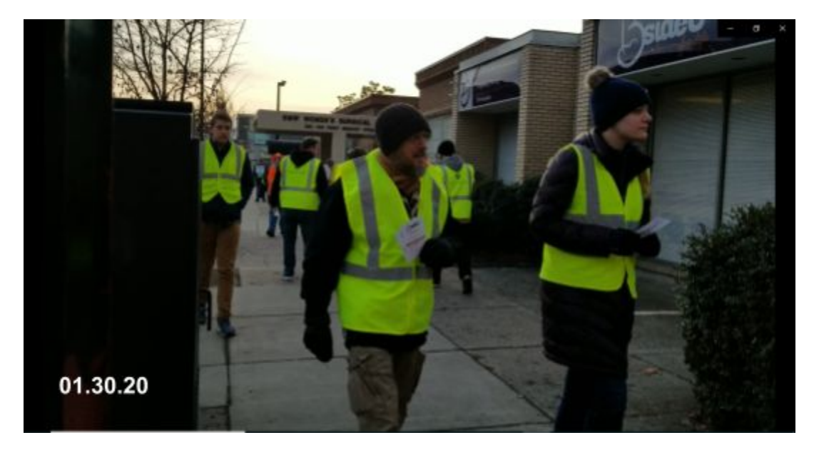
Protesters in fake escort vests fanning out to accost patients.