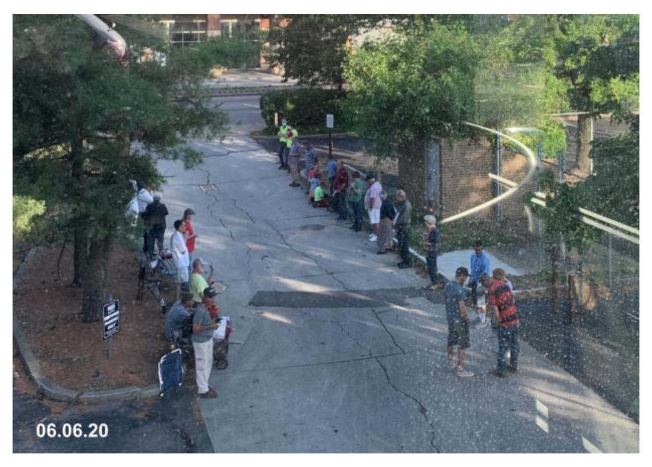
Protesters obstruct alley and EMW parking lot entrance.