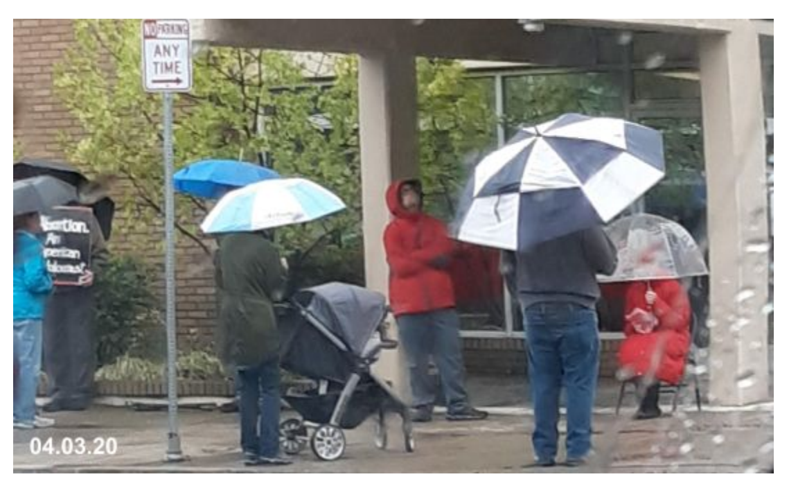
Protesters without masks obstructing entrance/ loading zone, seated in chair directly in entrance.