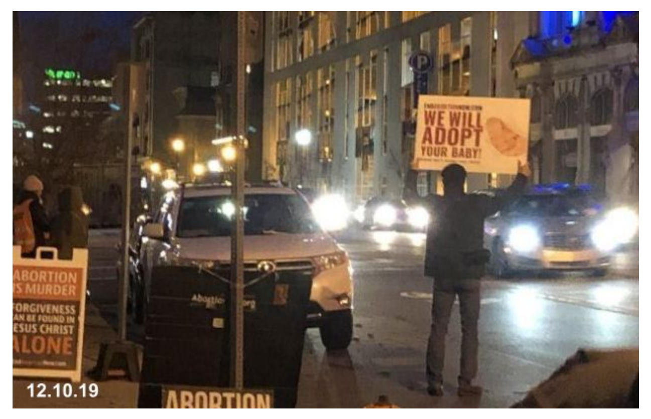
Protester obstructing traffic and loading zone, unattended signage in right of way and loading zone.