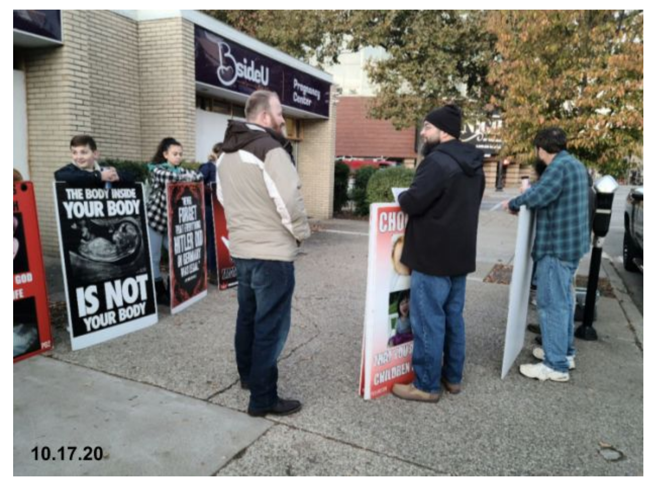
Protesters obstructing sidewalk with large signs, no masks or facial coverings.