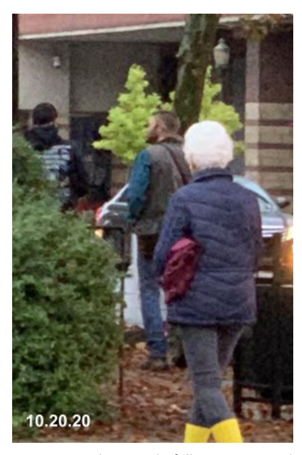
Protesters with no masks following patient through bushes to parking garage.