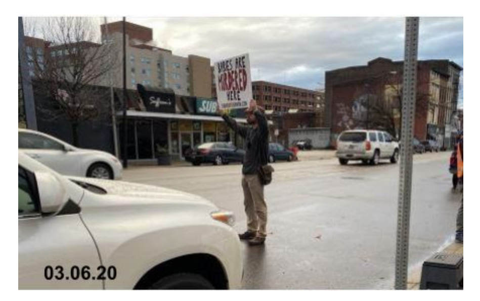
Protester without mask obstructing vehicular traffic and loading zone.