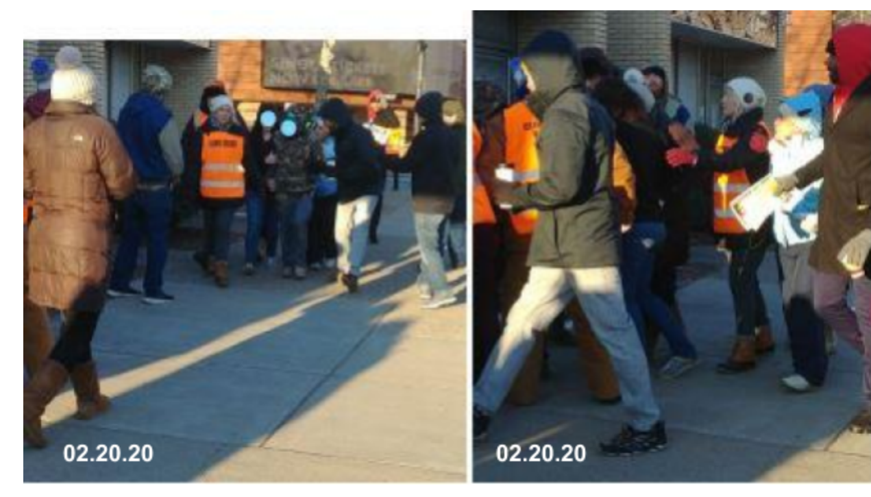
Protesters follow, crowd patient and their companion.

EXHIBIT 1 PHOTOGRAPHS DEMONSTRATING HARASSMENT, CROWDING, OBSTRUCTION, OBJECTS AND SIGNS IN RIGHTS-OF-WAY, SIGNAGE TETHERED TO PUBLIC PROPERTY, AND AMPLIFIED SOUND SYSTEMS