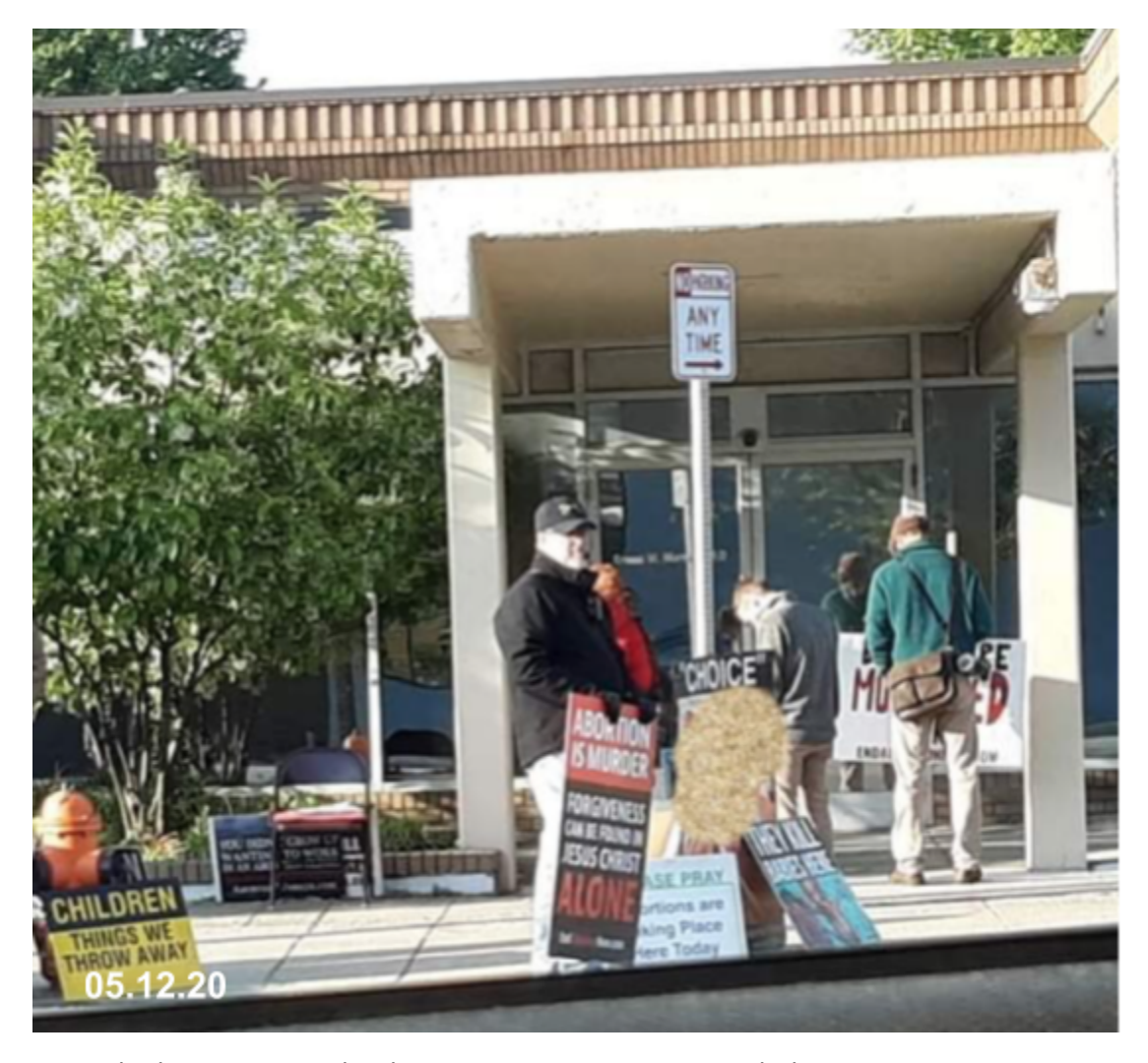
Unmasked protesters in loading zone, entrance, unattended posters.