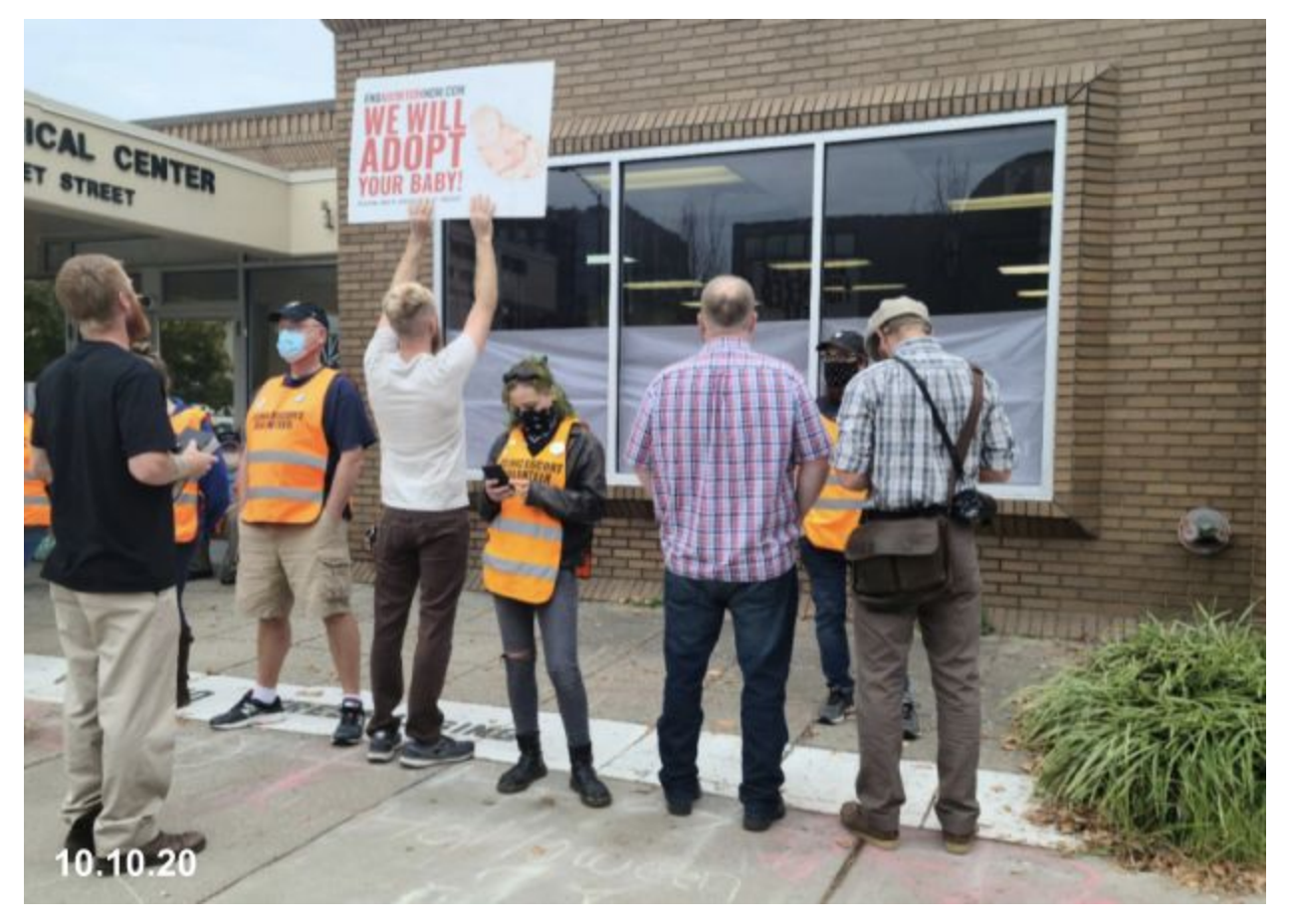
Protesters without masks shouting into EMW waiting room, trespassing onto property (white paint is EMW property).