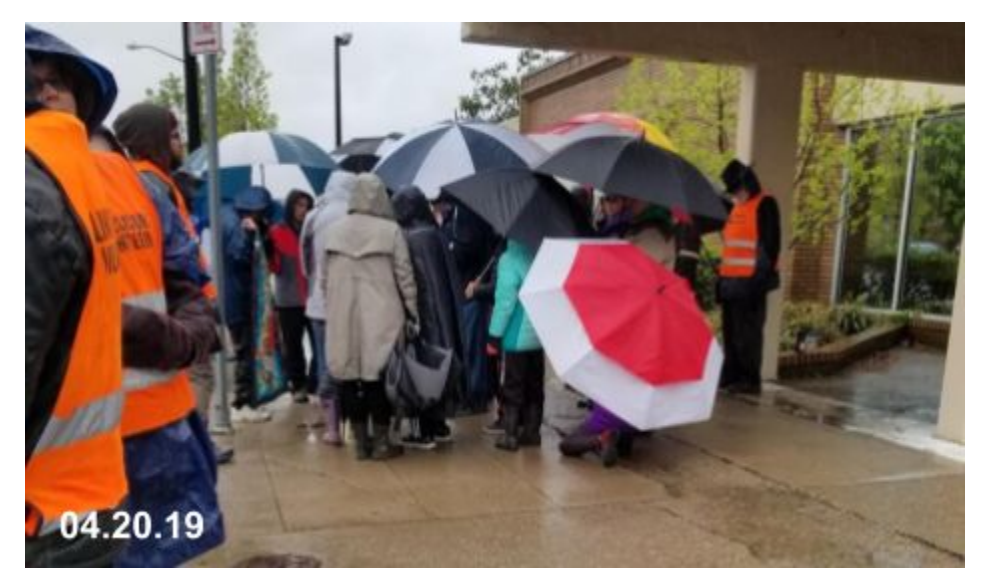
Protesters obstructing sidewalk and interfering with clinic entrance.