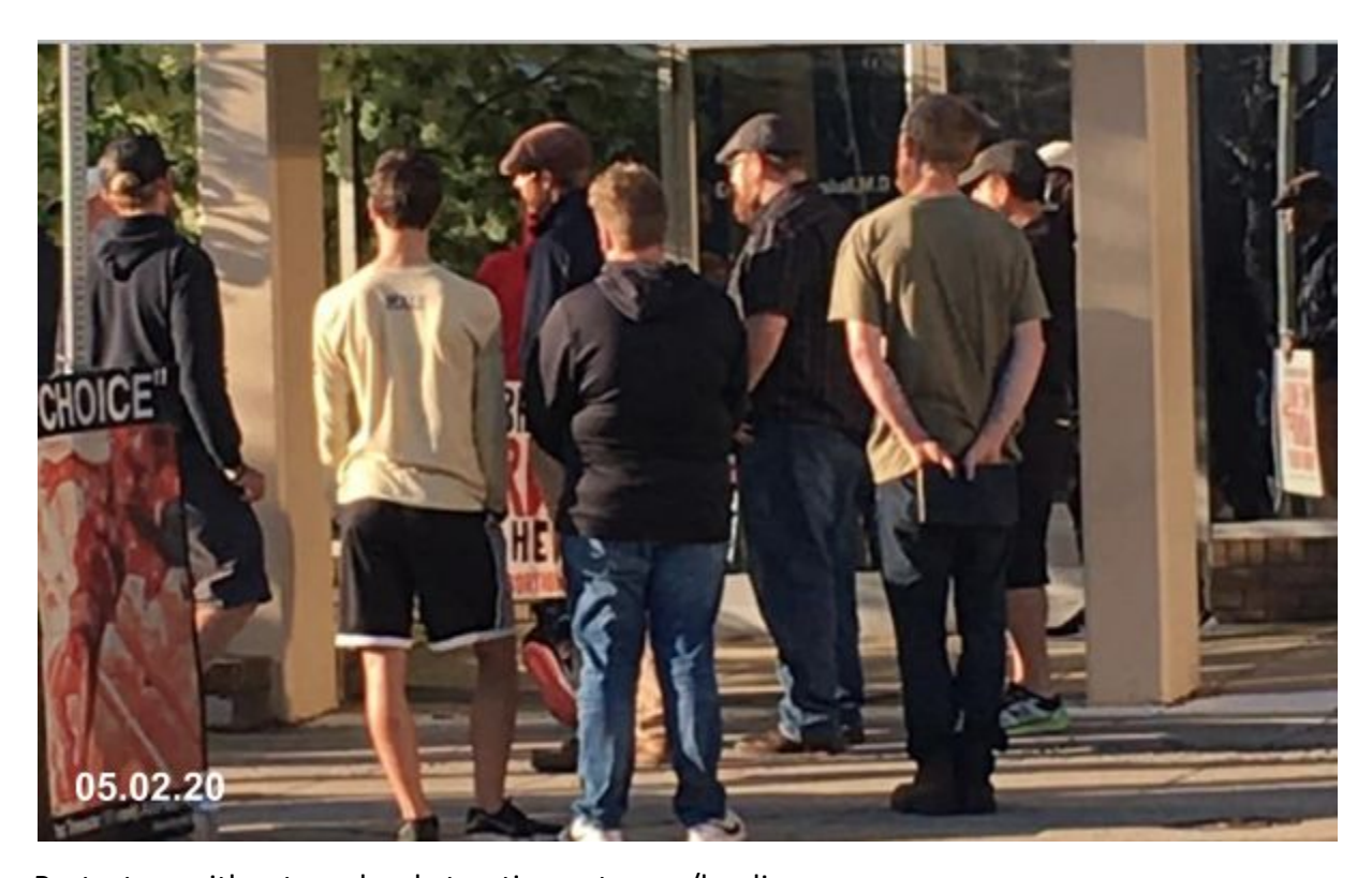
Protesters without masks obstructing entrance/loading zone.