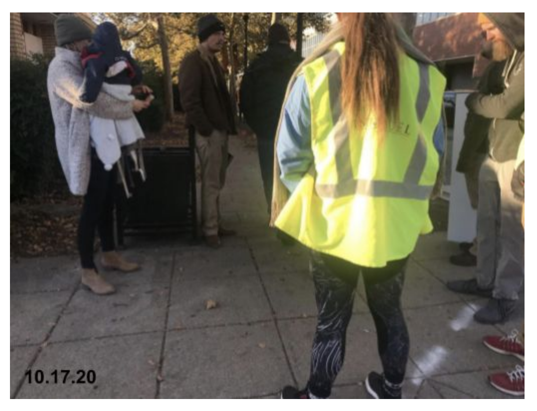
Unmasked protesters and fake escort in vest obstructing and interfering with public sidewalk and intersection at 2nd St. and Market.