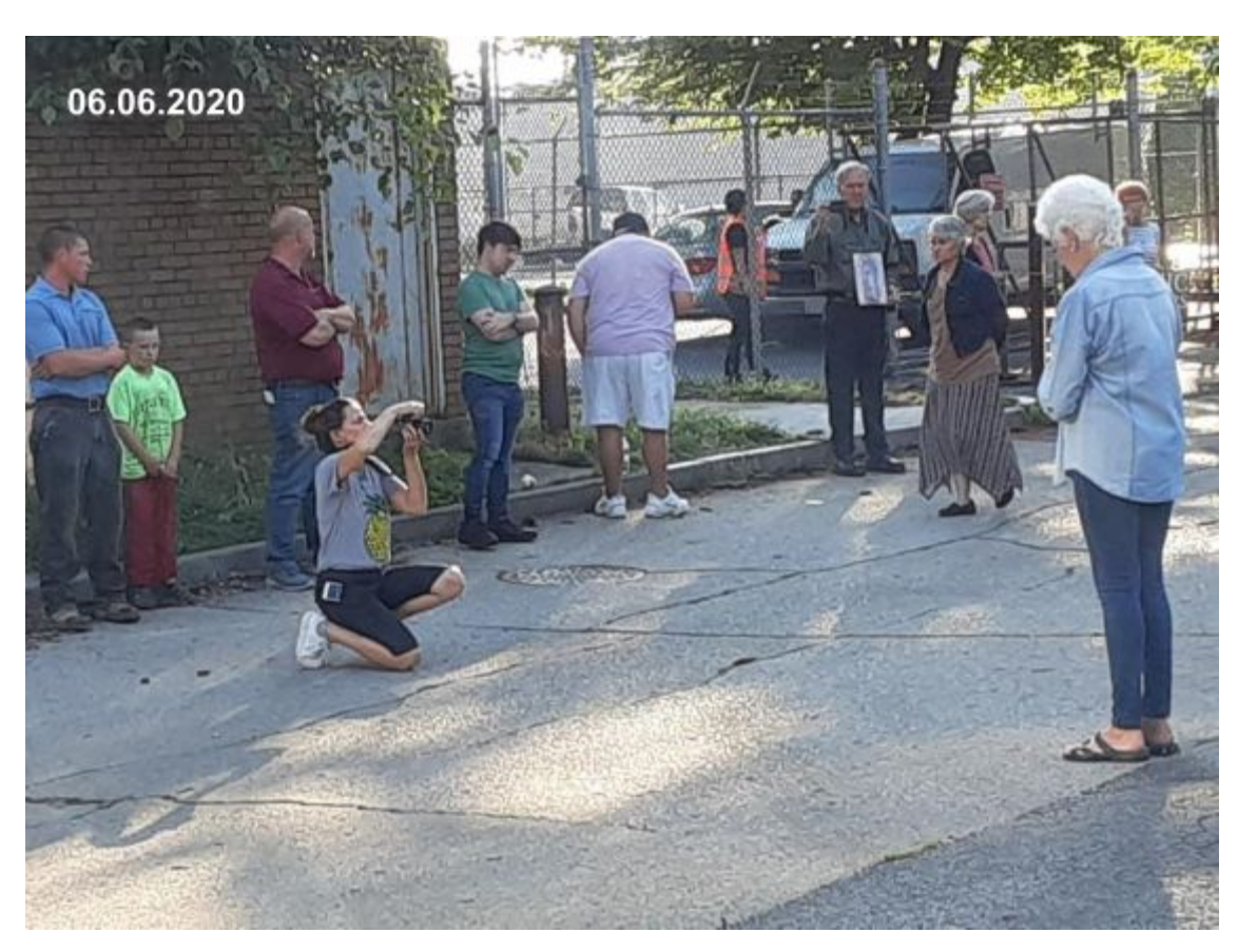
Protesters obstructing alley behind clinic and EMW parking lot entrance.