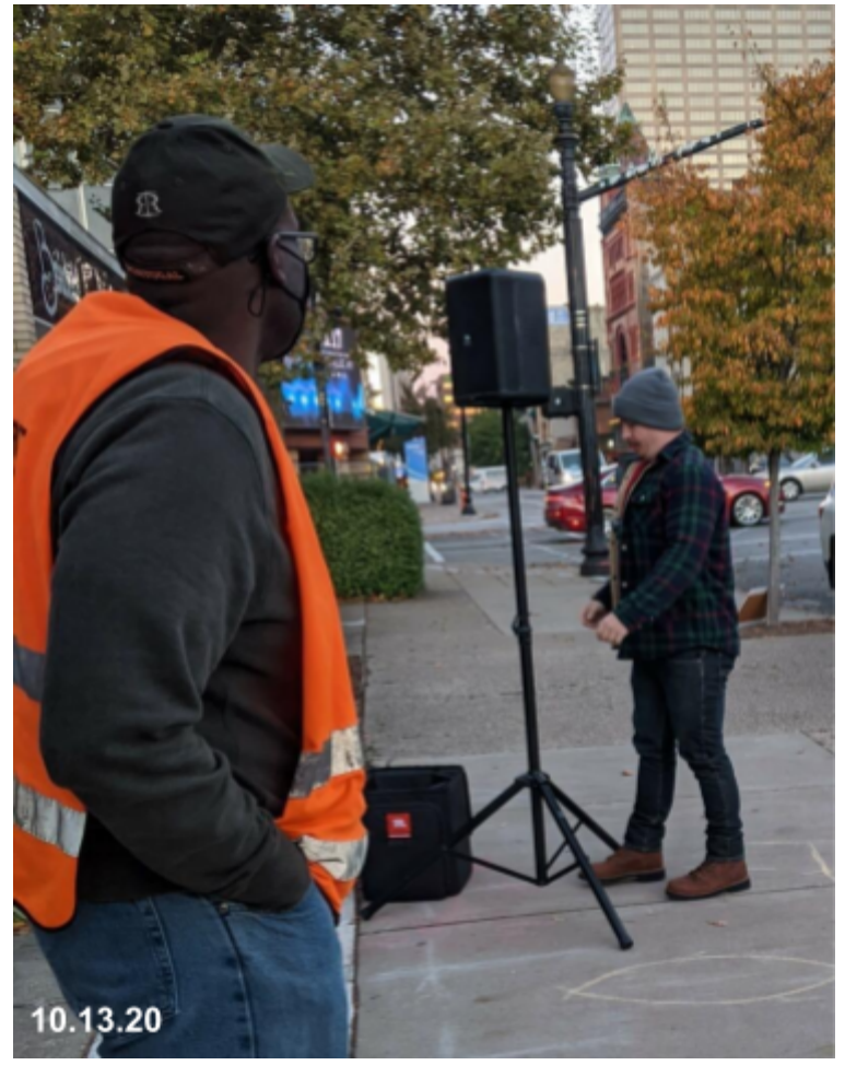
Unmasked protester sets up loudspeaker directed at EMW waiting room, obstructing right-of-way.