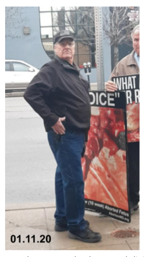
Armed protester who threatened clinic escort.