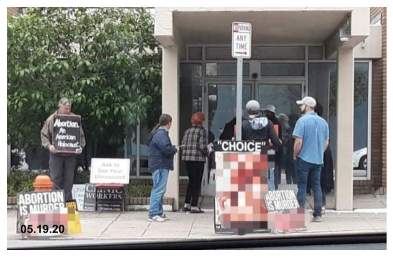
Protesters obstructing entrance and loading zones, signs in loading zone and attached to signpost, fire hydrant. Chairs and other unattended signs.