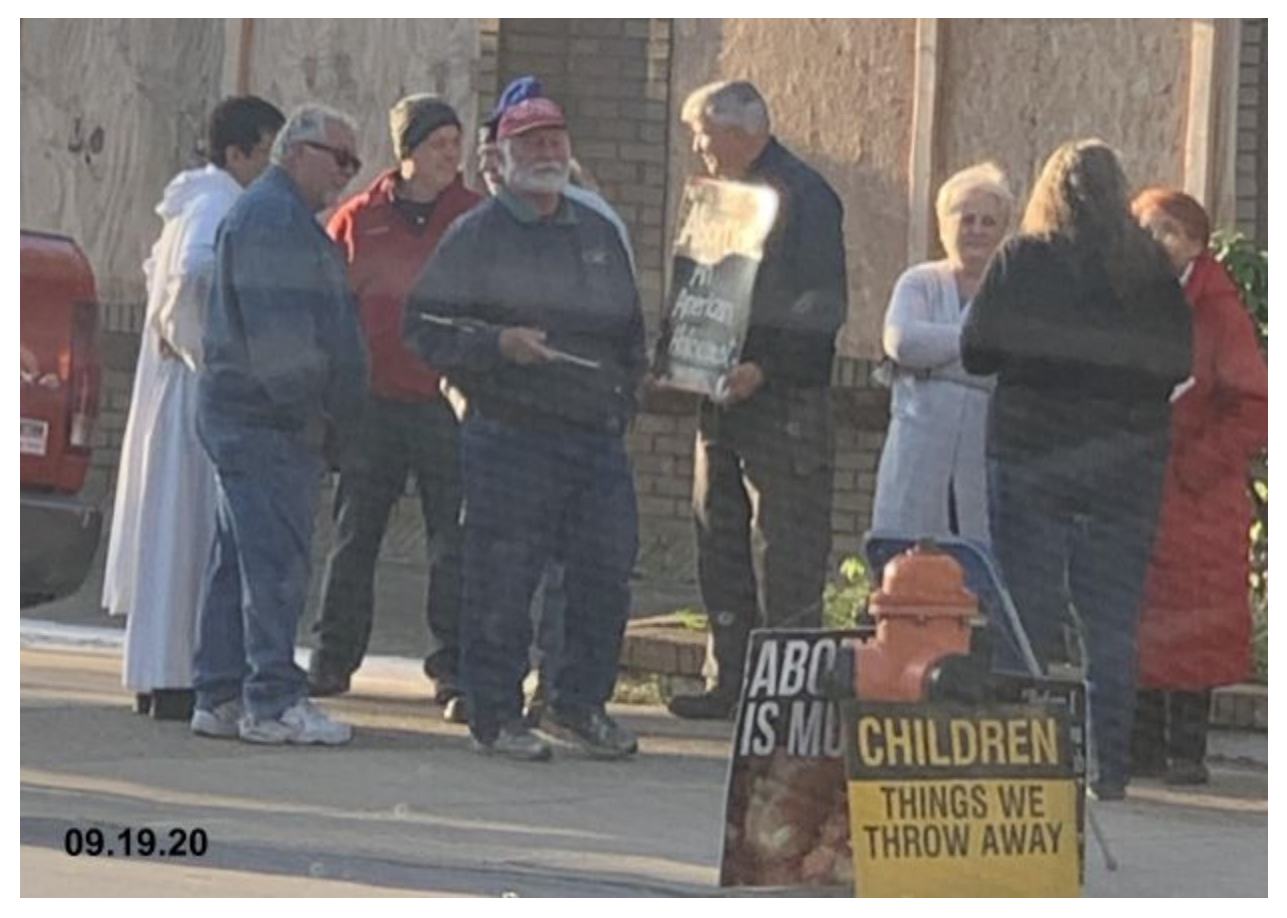
Protesters without face masks waiting for patients, unattended signage attached to fire hydrant.