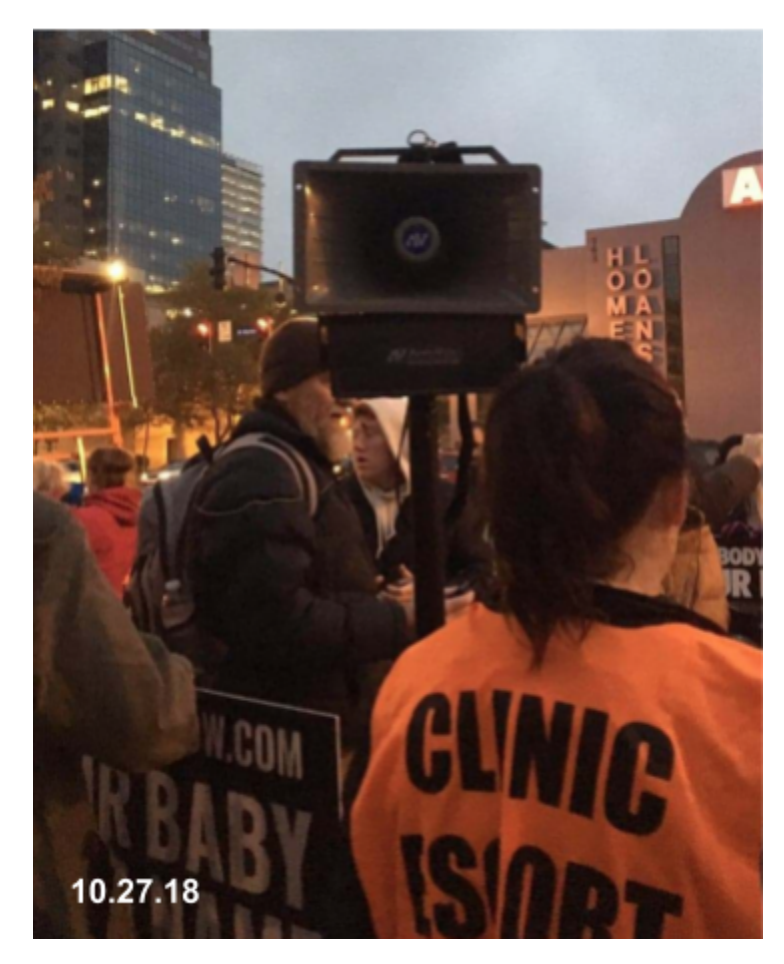
Amplified sound system blasting into EMW waiting room.