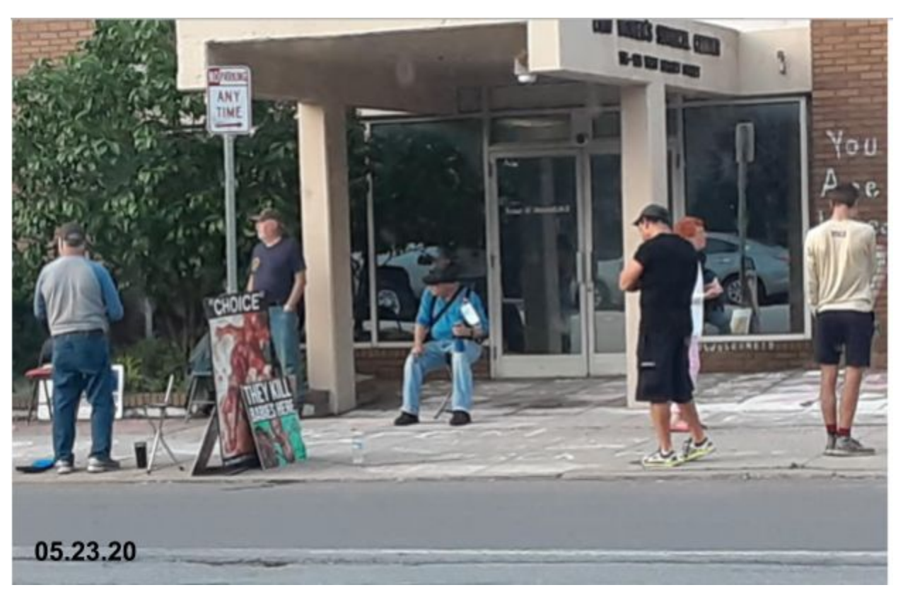
Protester without mask seated on chair directly in middle of entrance.