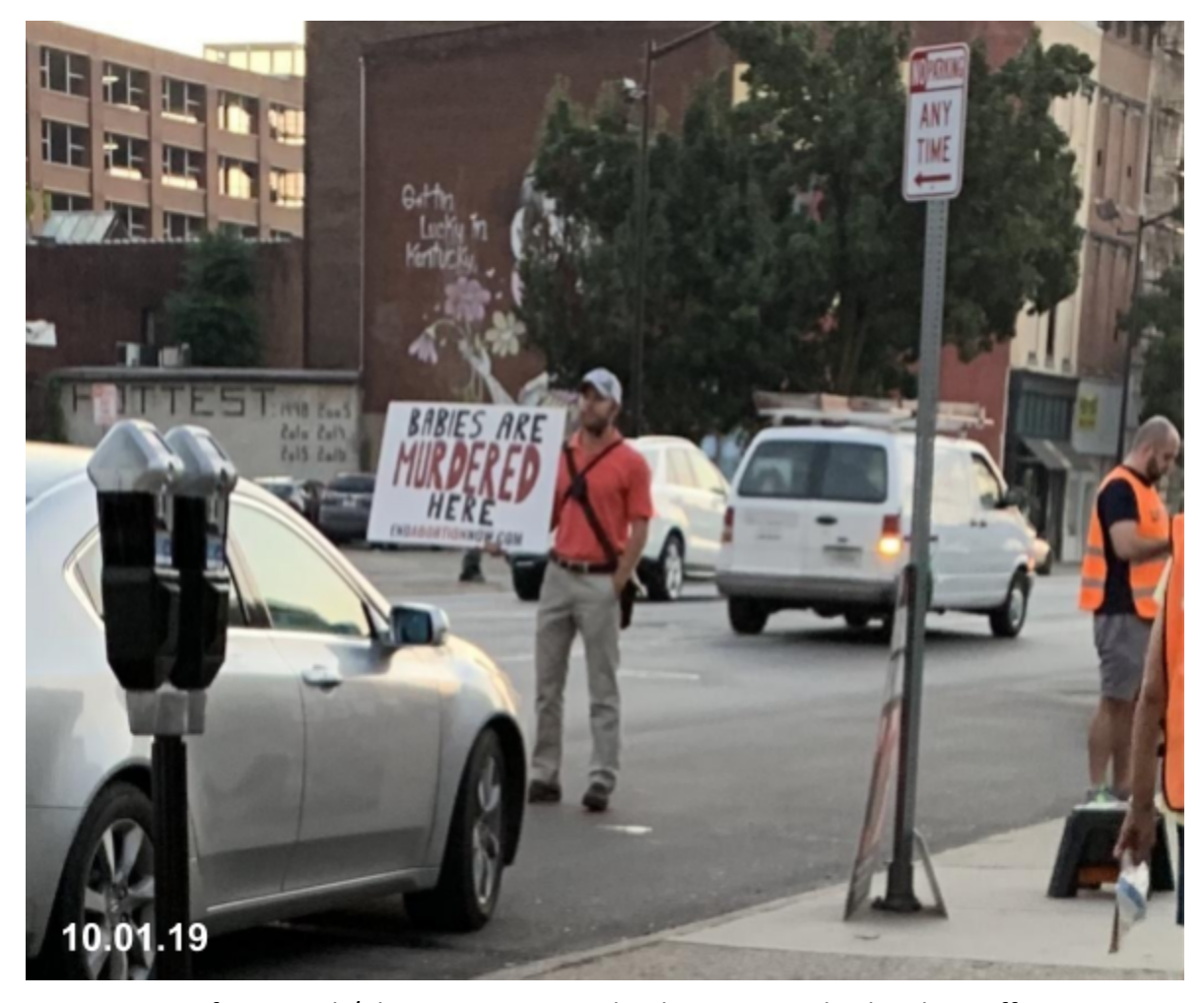
Protester interfering with/obstructing patient loading zone and vehicular traffic.