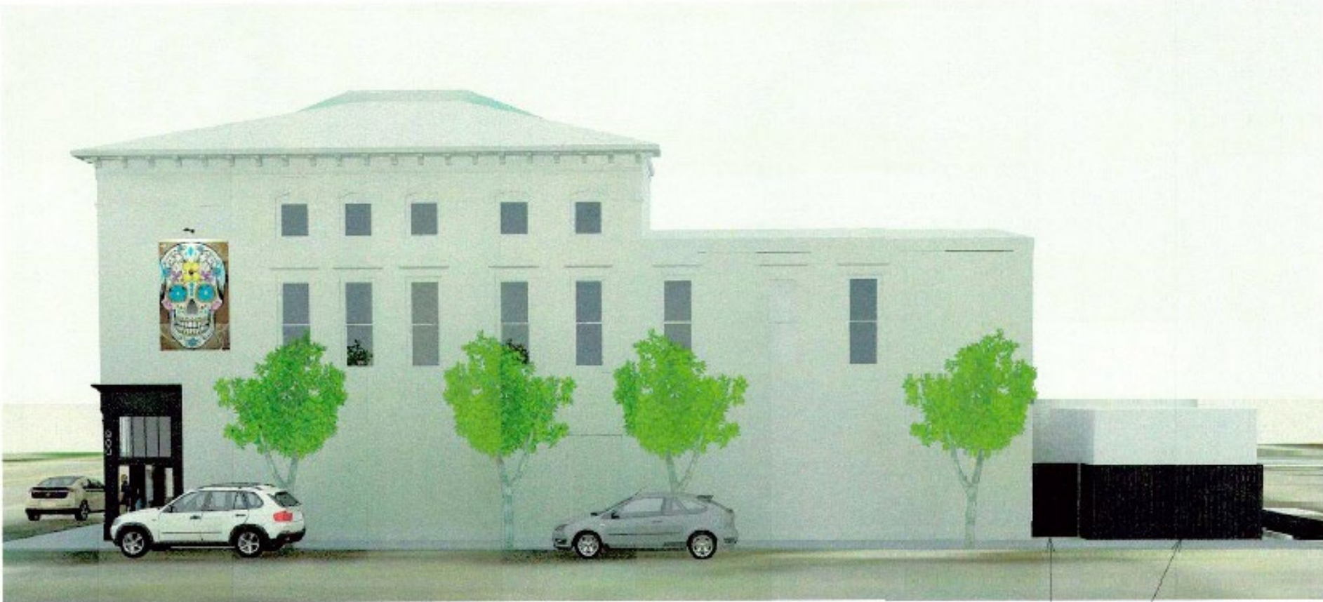
PROPOSED WEST VIEW

PROPOSED STEEL PRIVACY SCREEN SYSTEM AROUND COOLER FREEZER & DELIVERY AREA