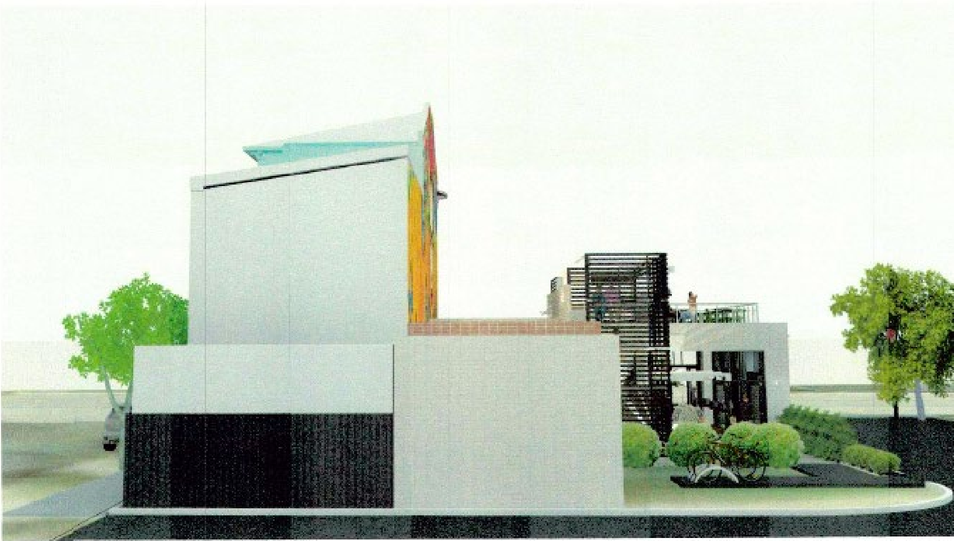
PROPOSED SOUTH VIEW