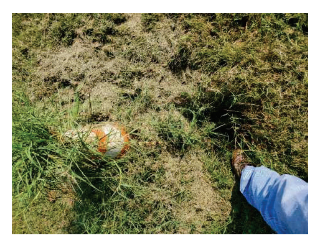
Sinkhole present in Ballfield