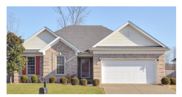
6719 North Drive Louisville, KY, 40272