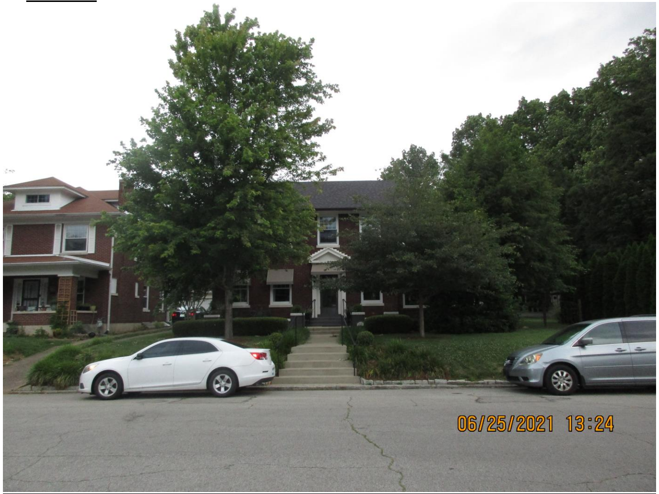
Front of subject property.