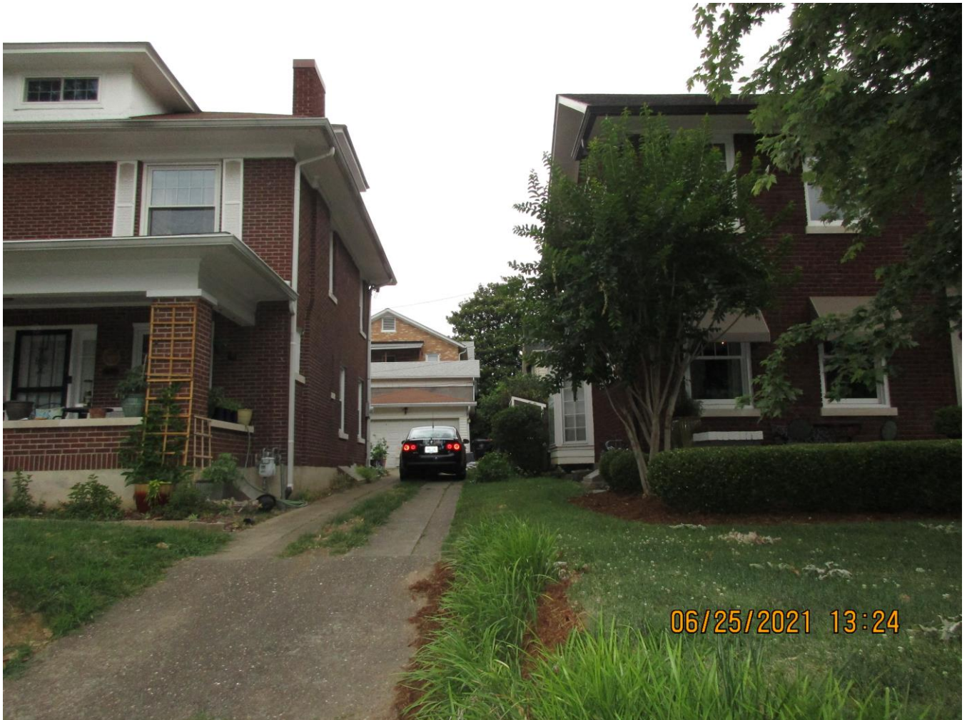
Existing side yard setback.