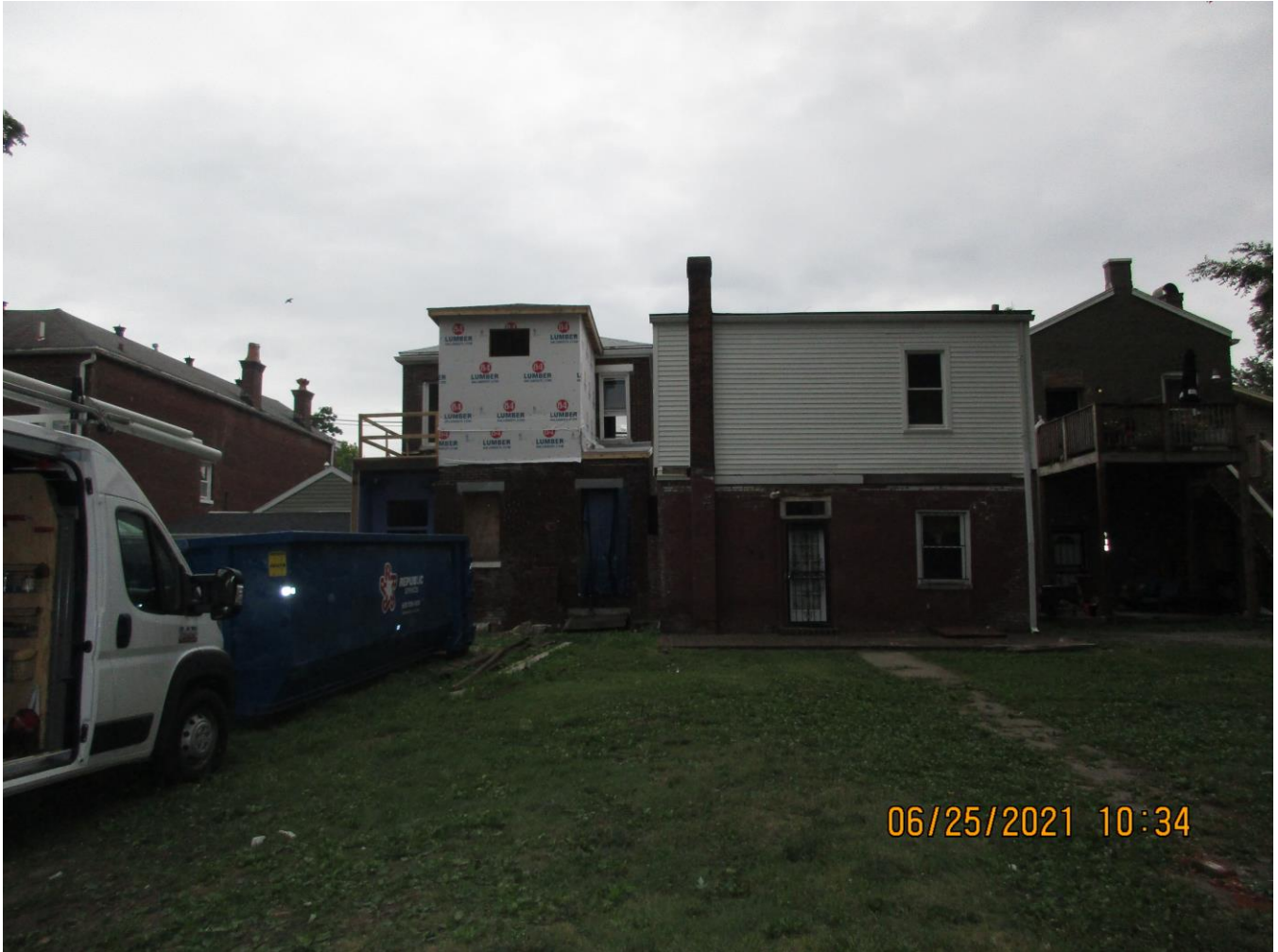
Subject property from the rear.