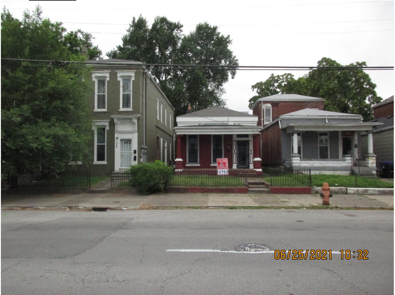
Front of the subject property.