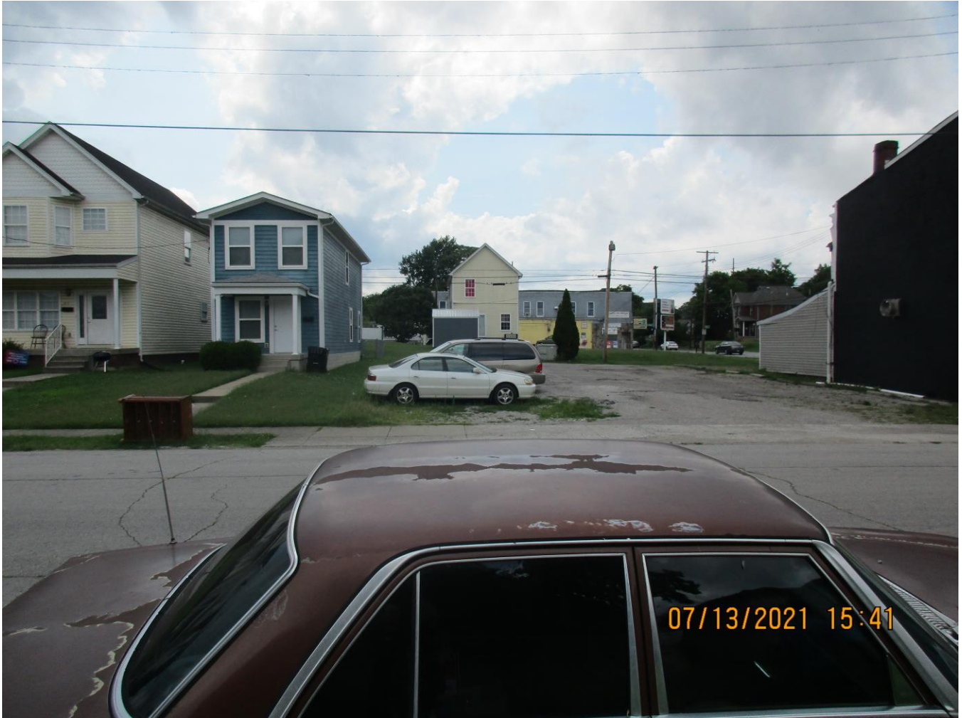
Properties across S. 20 th Street.