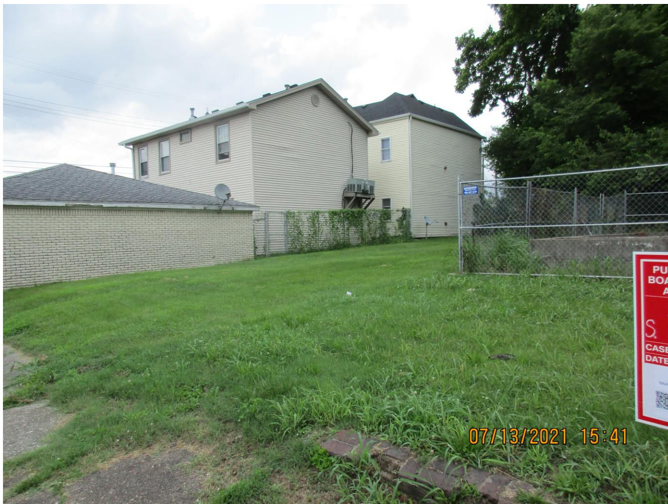
Properties to the left.