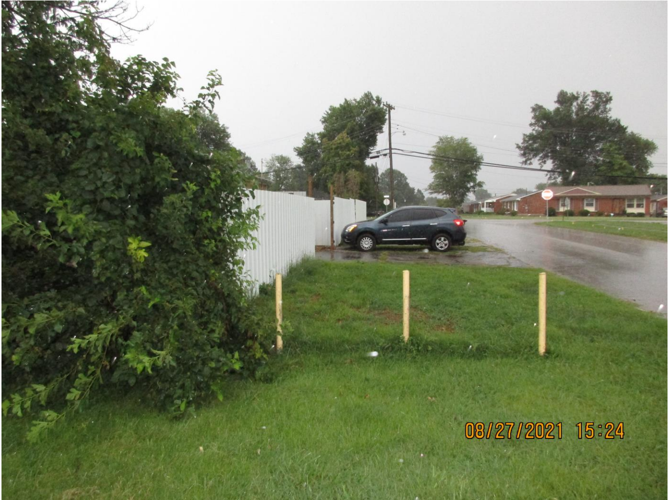
Fence from rear of property.