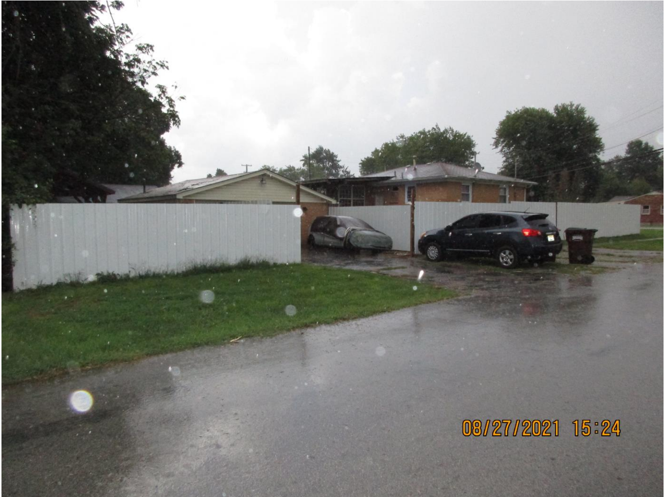
Fence from Pirate Lane.