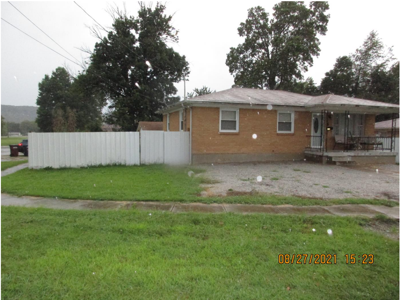
Fence from Caven Avenue.