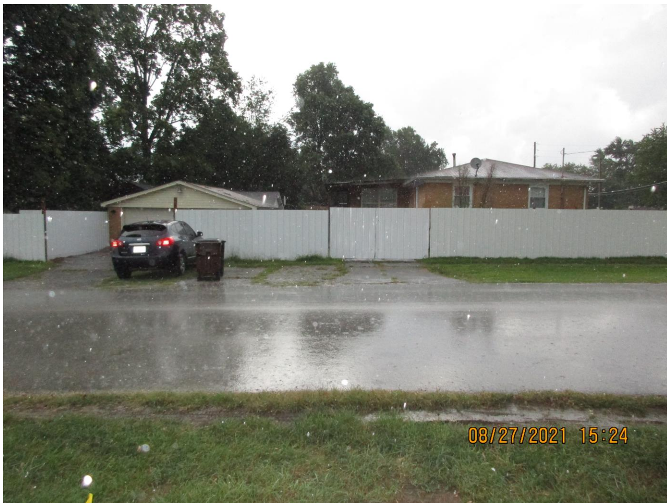
Fence from across Pirate Lane.