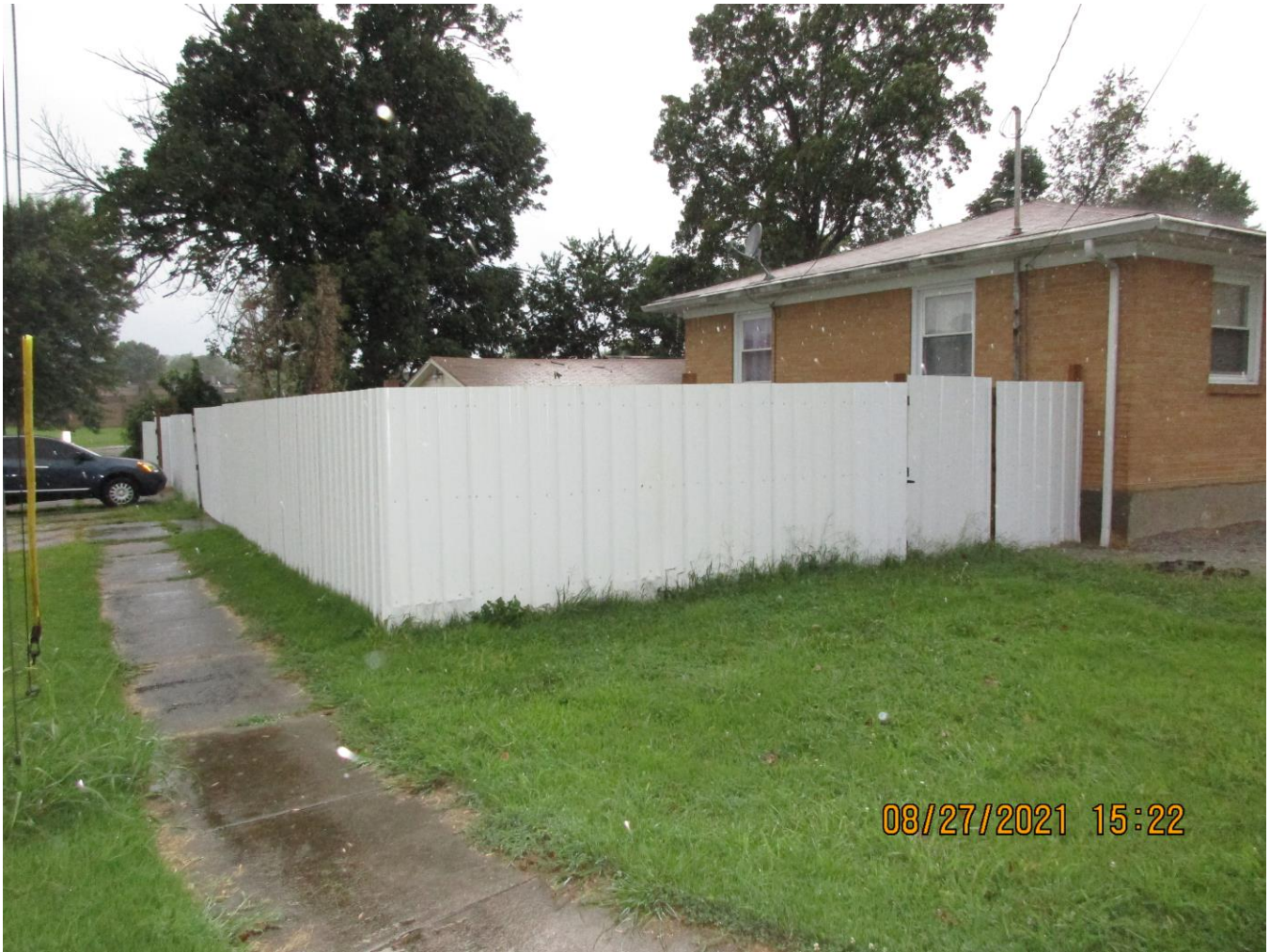
Fence from intersection.