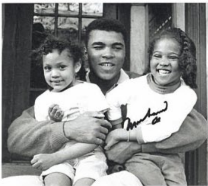
Muhammad Ali- Three time world heavy weight boxing champion, activist and philanthropist.