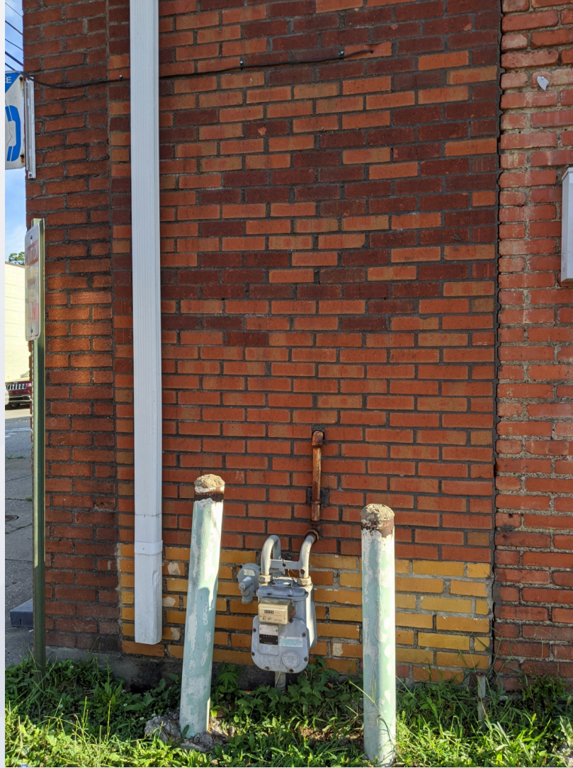
South Side