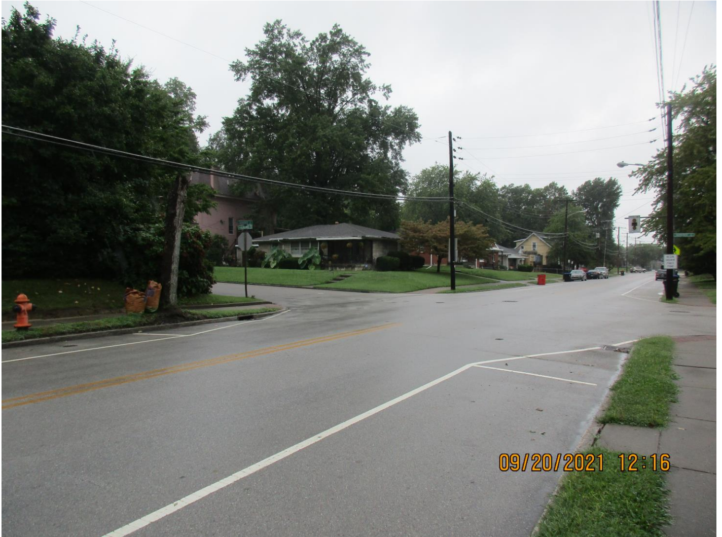
Right of subject site