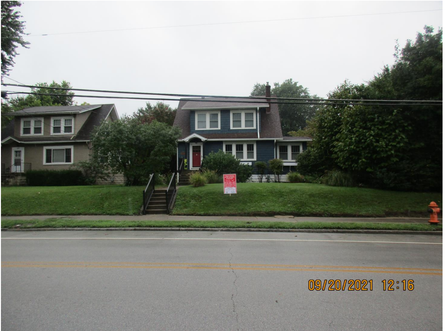
Front of subject site