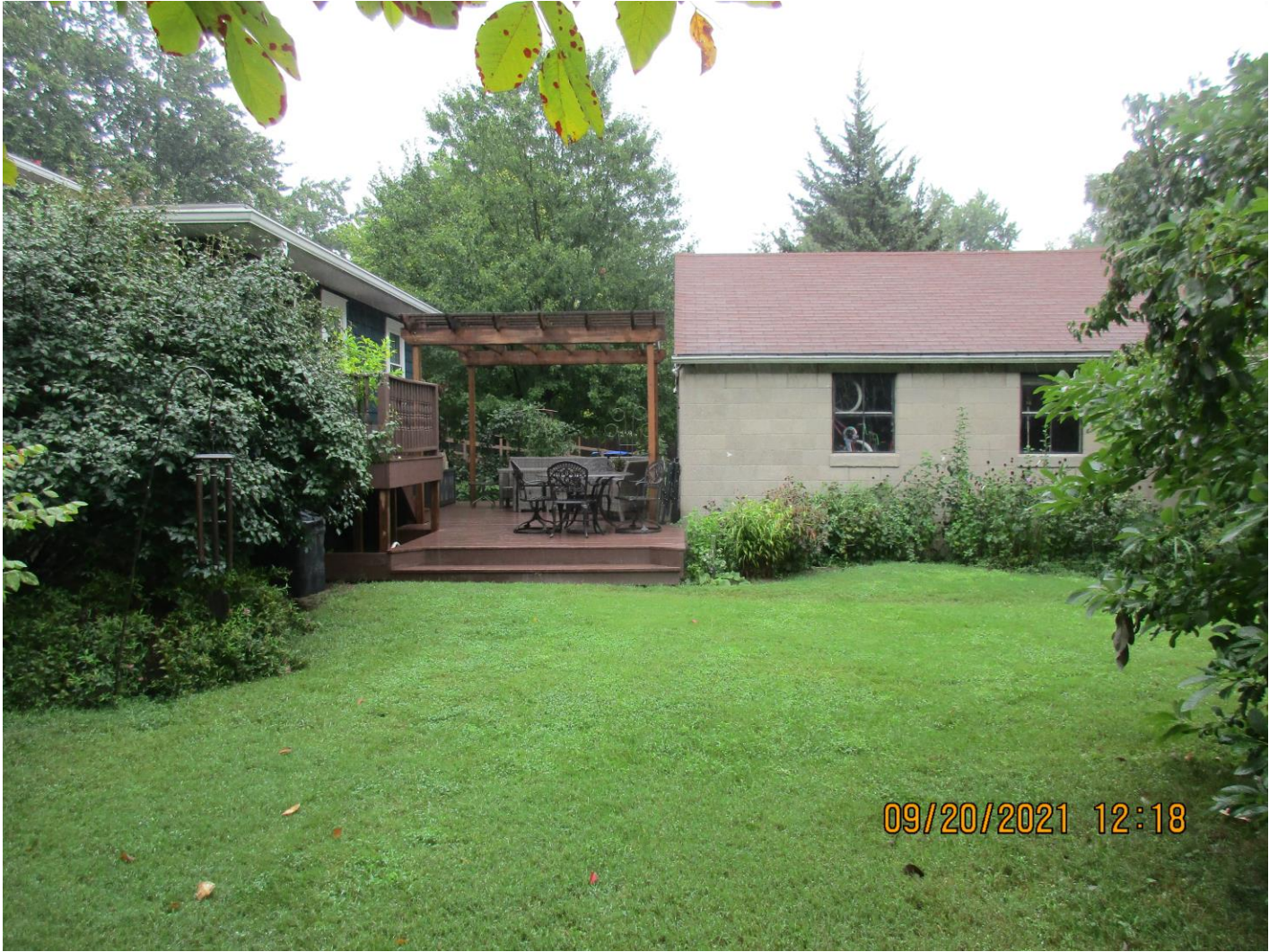
Variance Area, existing deck