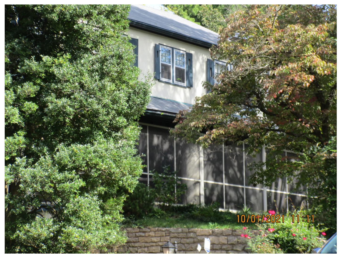
Across Rosewood Ave.