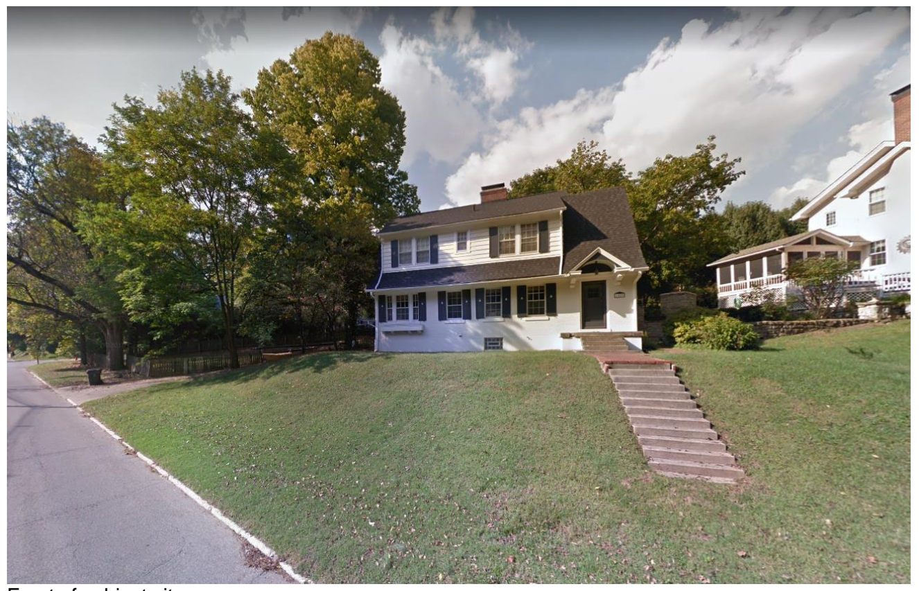
Front of subject site