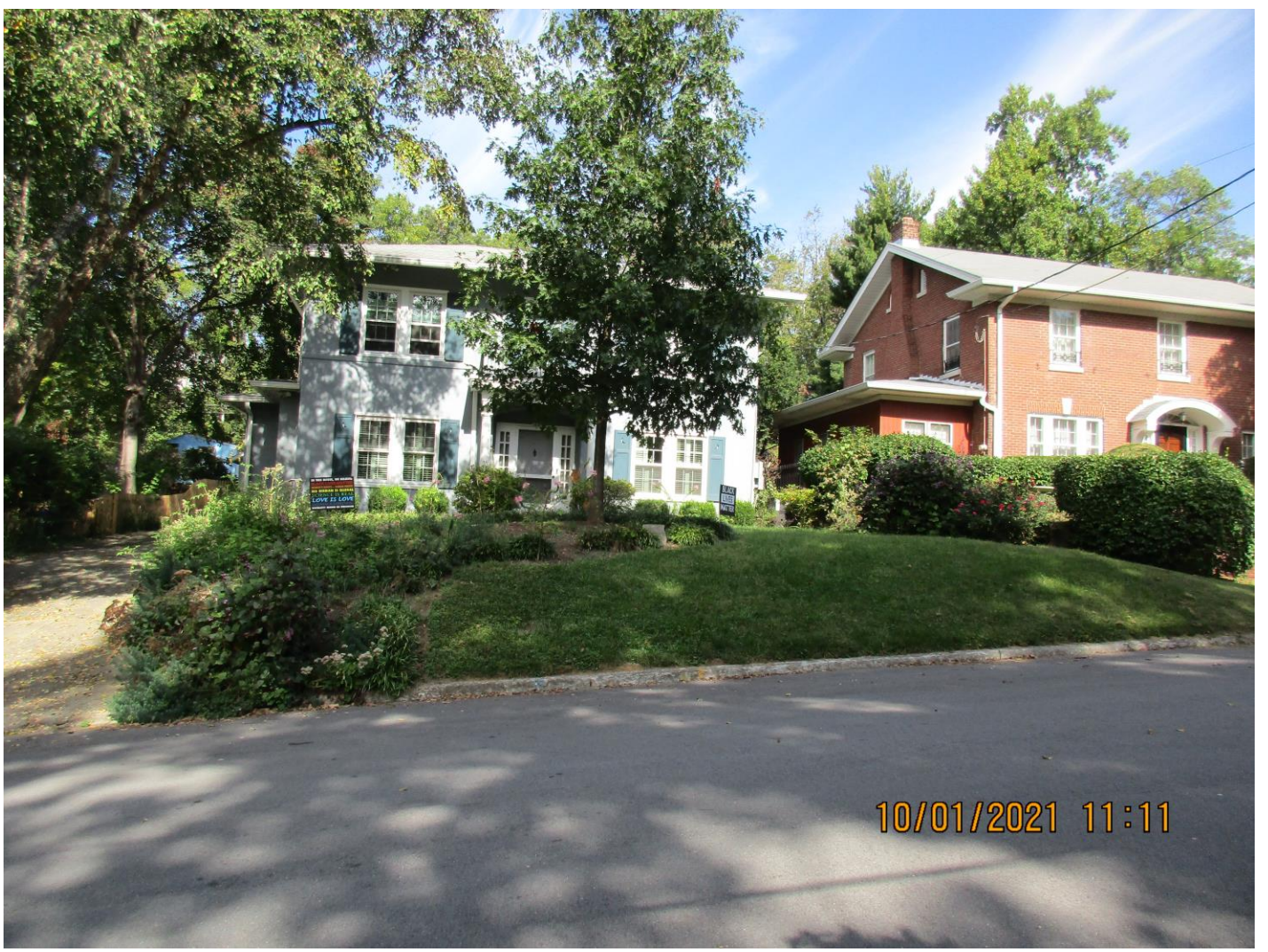
Across Rosewood Ave.