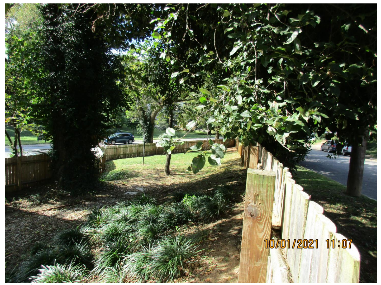
View of open space from variance area.