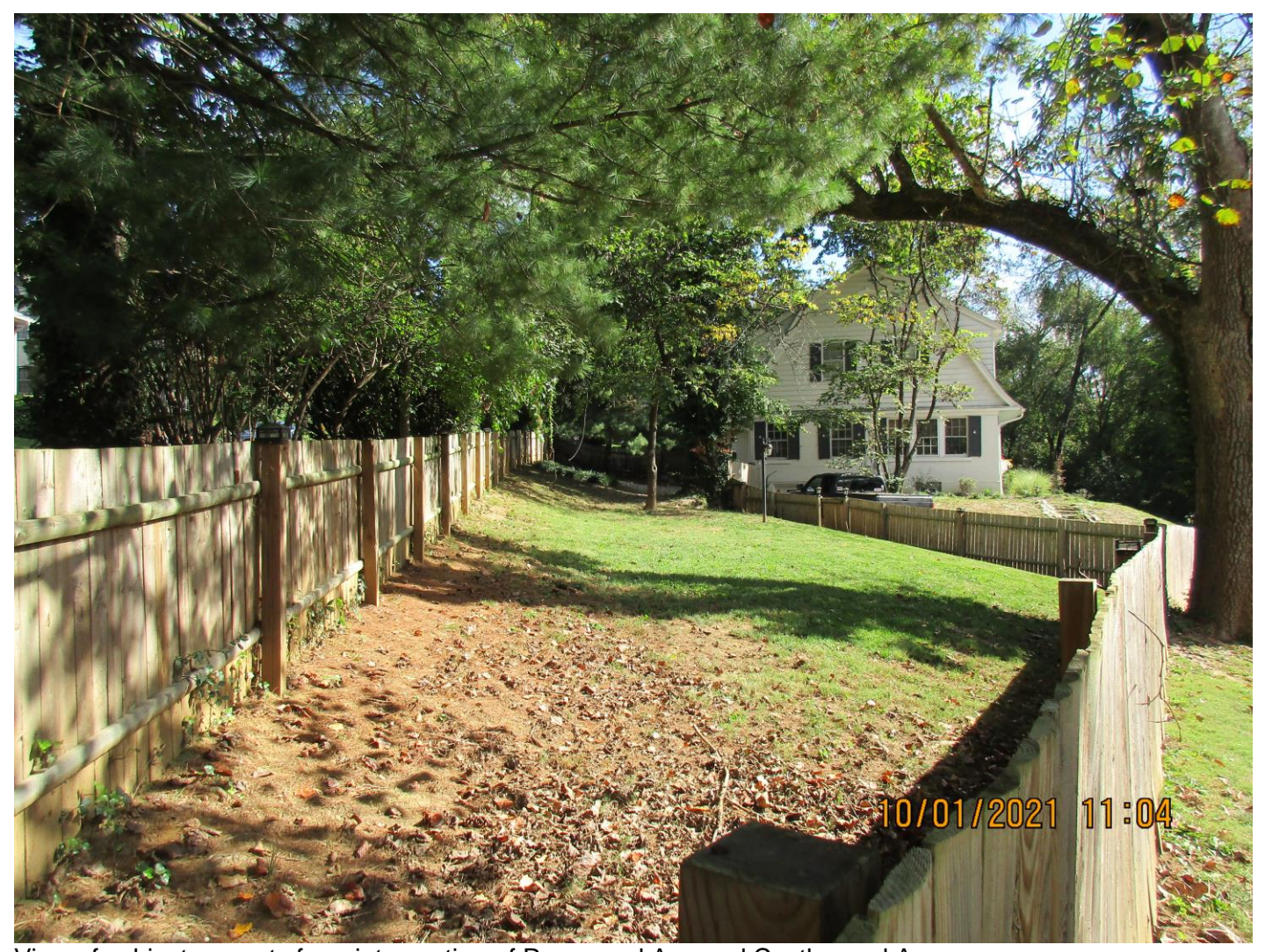
View of subject property from intersection of Rosewood Ave and Castlewood Ave.