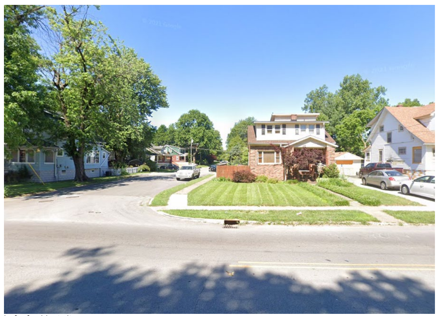
Left of subject site.