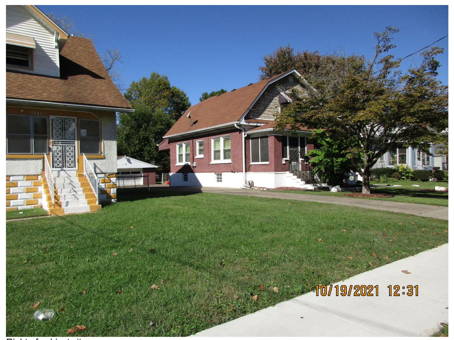
Right of subject site.