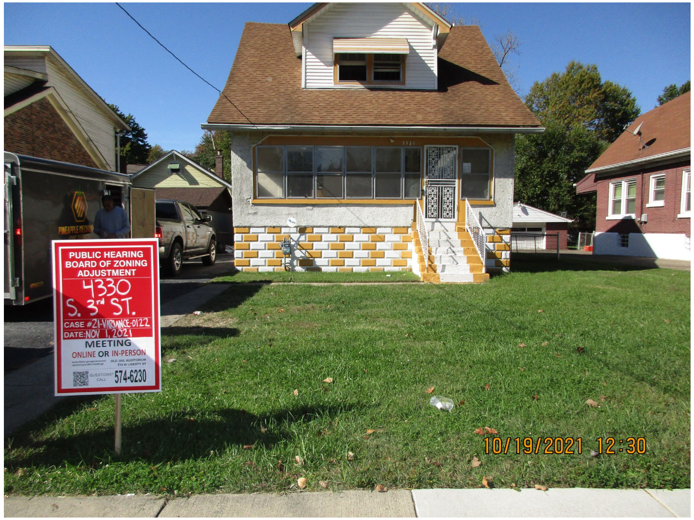
Front of subject site.