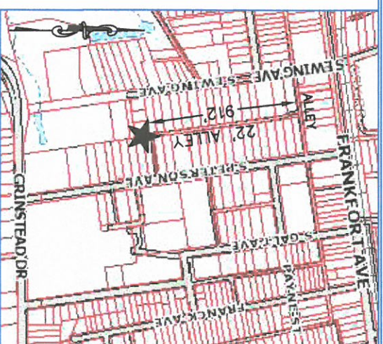
Location Map No Scale