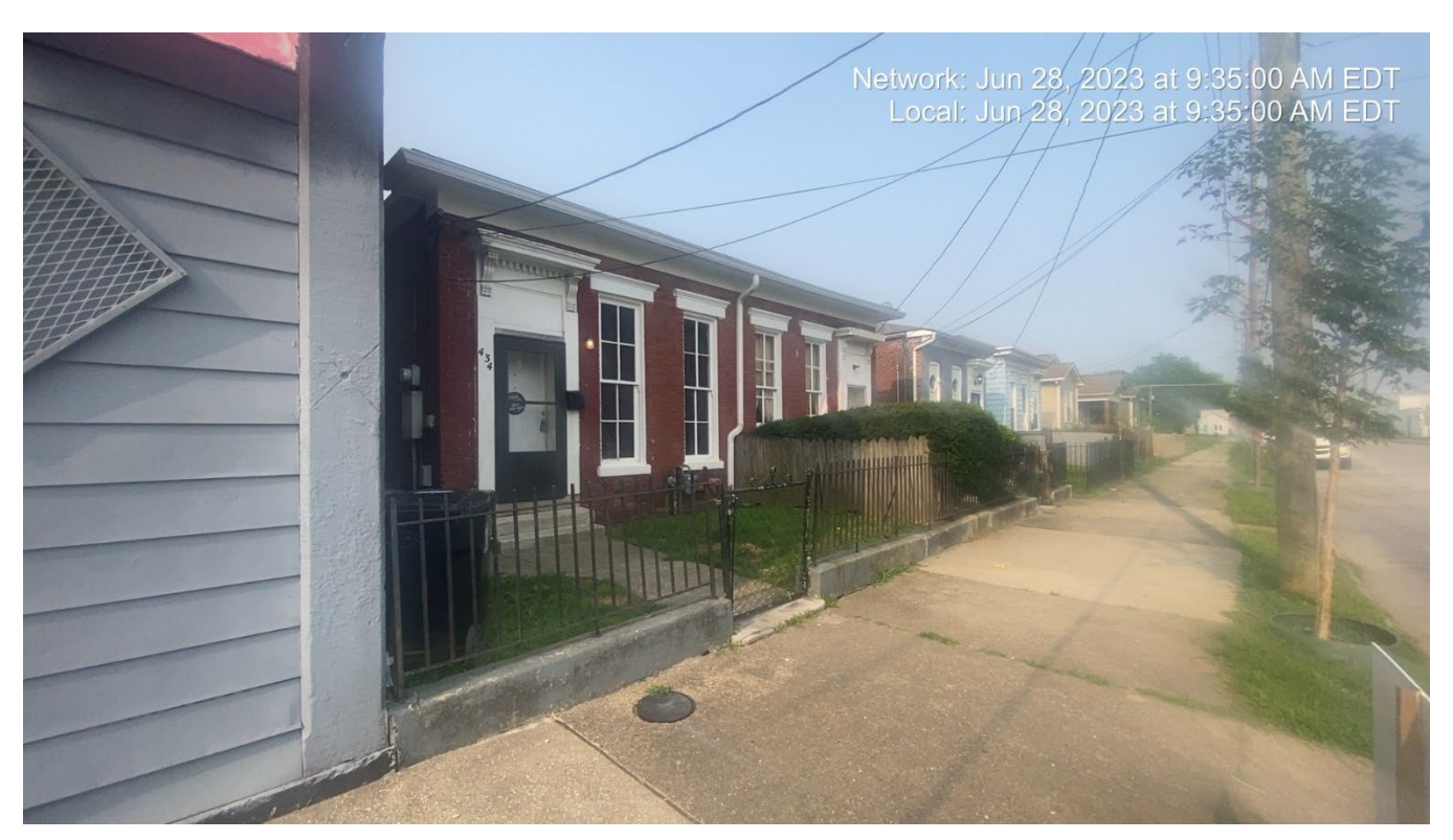
To the right of subject site.