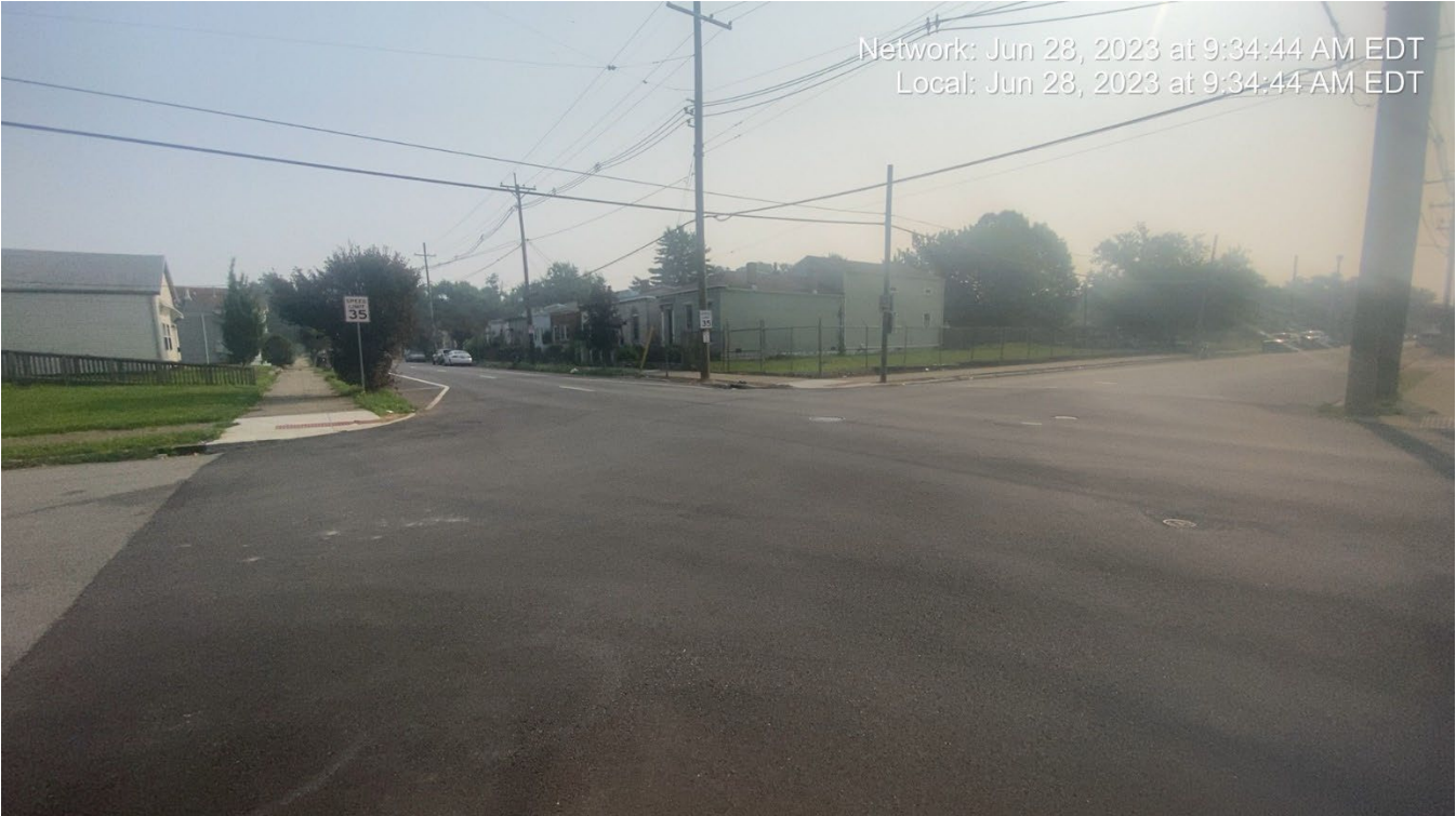
At the corner of S. Jackson St and E. Caldwell St.