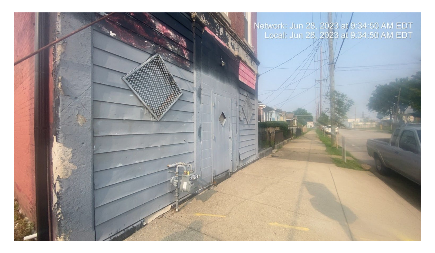
Subject site; front façade, facing E. Caldwell St.