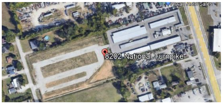
8213 Nash Road a.k.a 8202 National Turnpike -Vacant Site

The original self-storage facility was approved under a conditional use permit. Subsequently the adjacent site was proposed for an expansion of the self-storage facility and the modified CUP was approved, MCUP record number 16CUP1040. However, the expansion was never built.