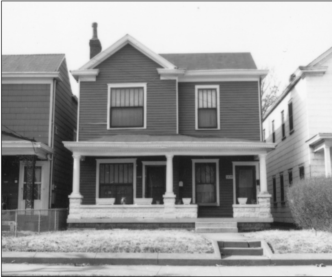
Figure 2. 1974 Designation Photo of 1436 S Brook St.