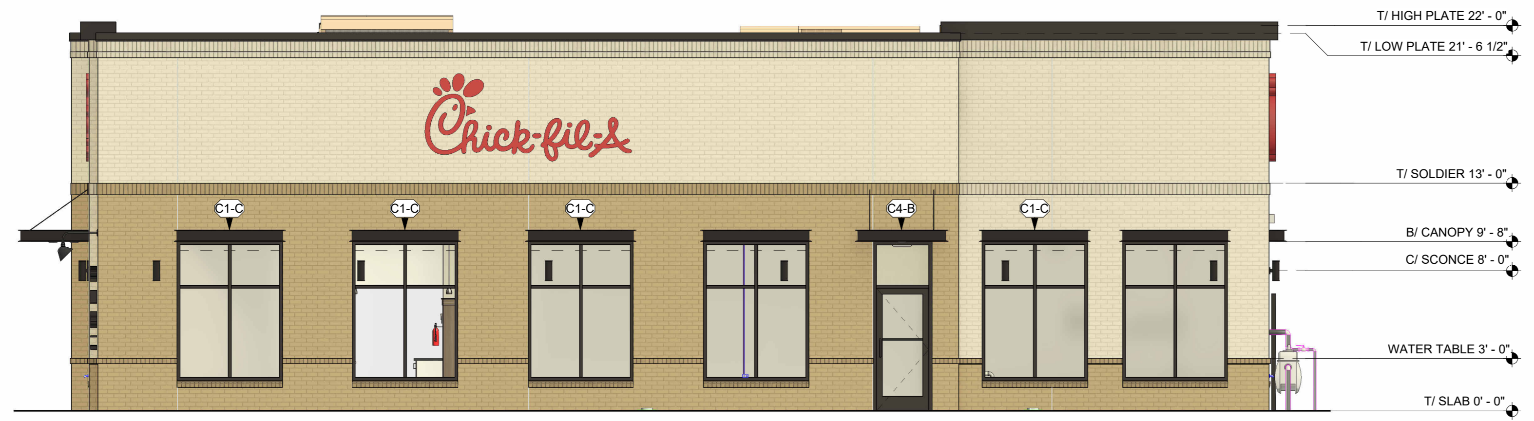
EXTERIOR ELEVATION 3/16" = 1'-0"