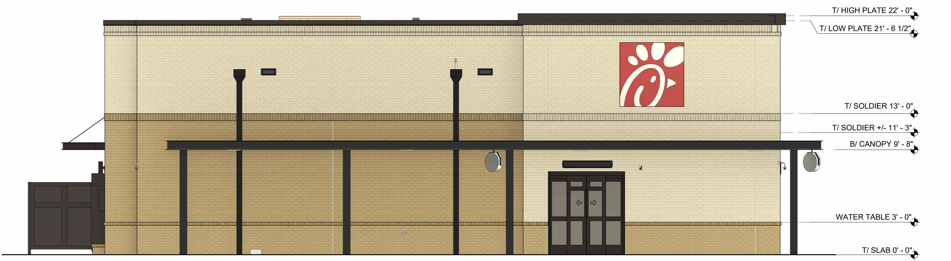
EXTERIOR ELEVATION 3/16" = 1'-0"