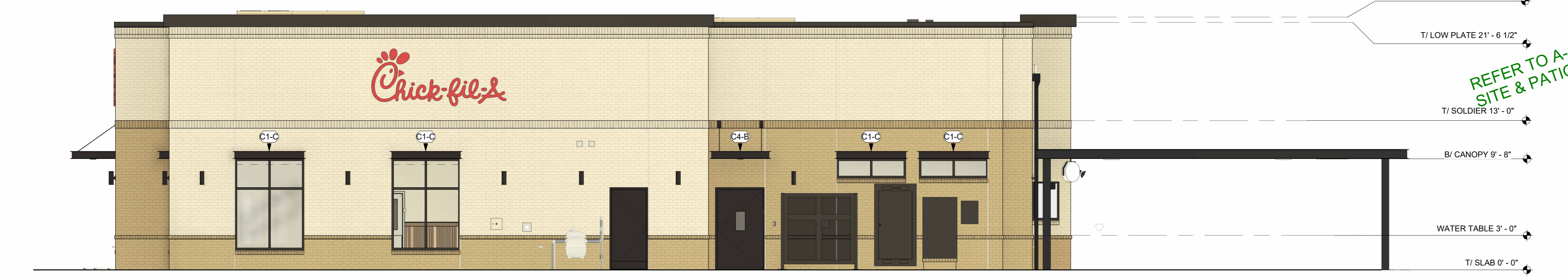
EXTERIOR ELEVATION 3/16" = 1'-0"

REFER TO A-100 SHEETS FOR THE SITE & PATIO LAYOUTS