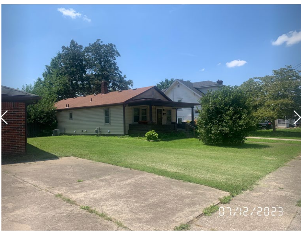
To the right of Subject Site (1214 Belmar Dr).