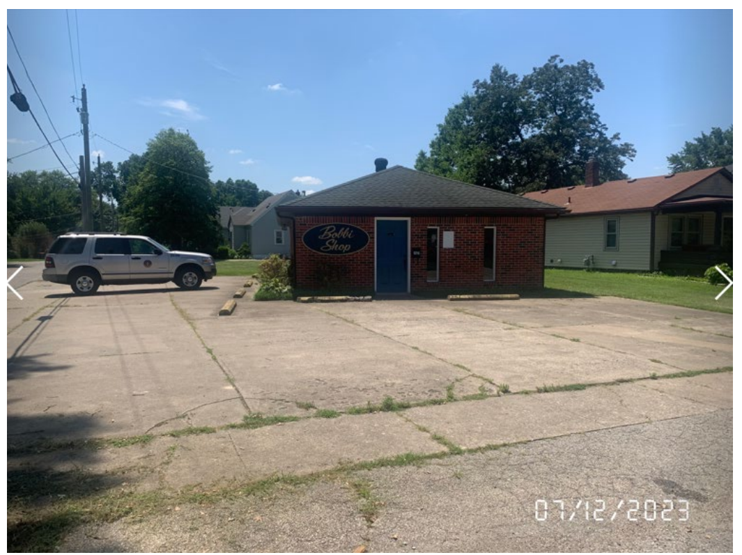
Subject Site (1216 Belmar Dr).