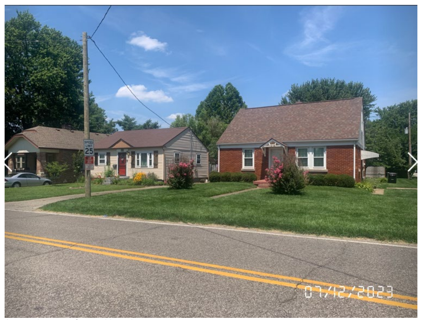
Across the street from subject site.