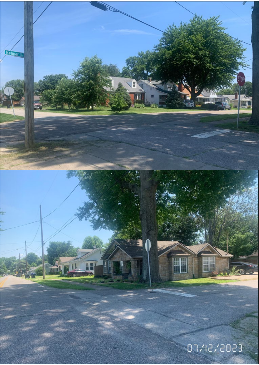
Intersection of Belmar Dr. and Fayette Ave.