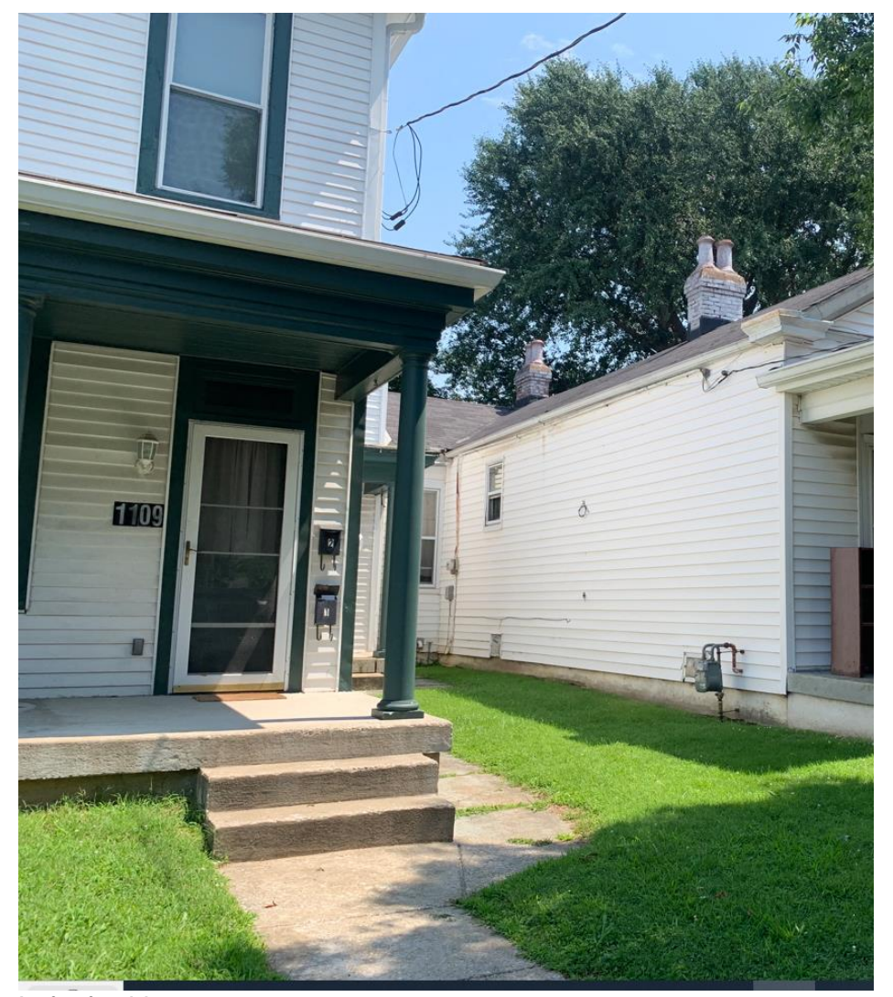
Left of subject property.