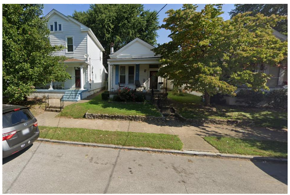
Right of subject property.