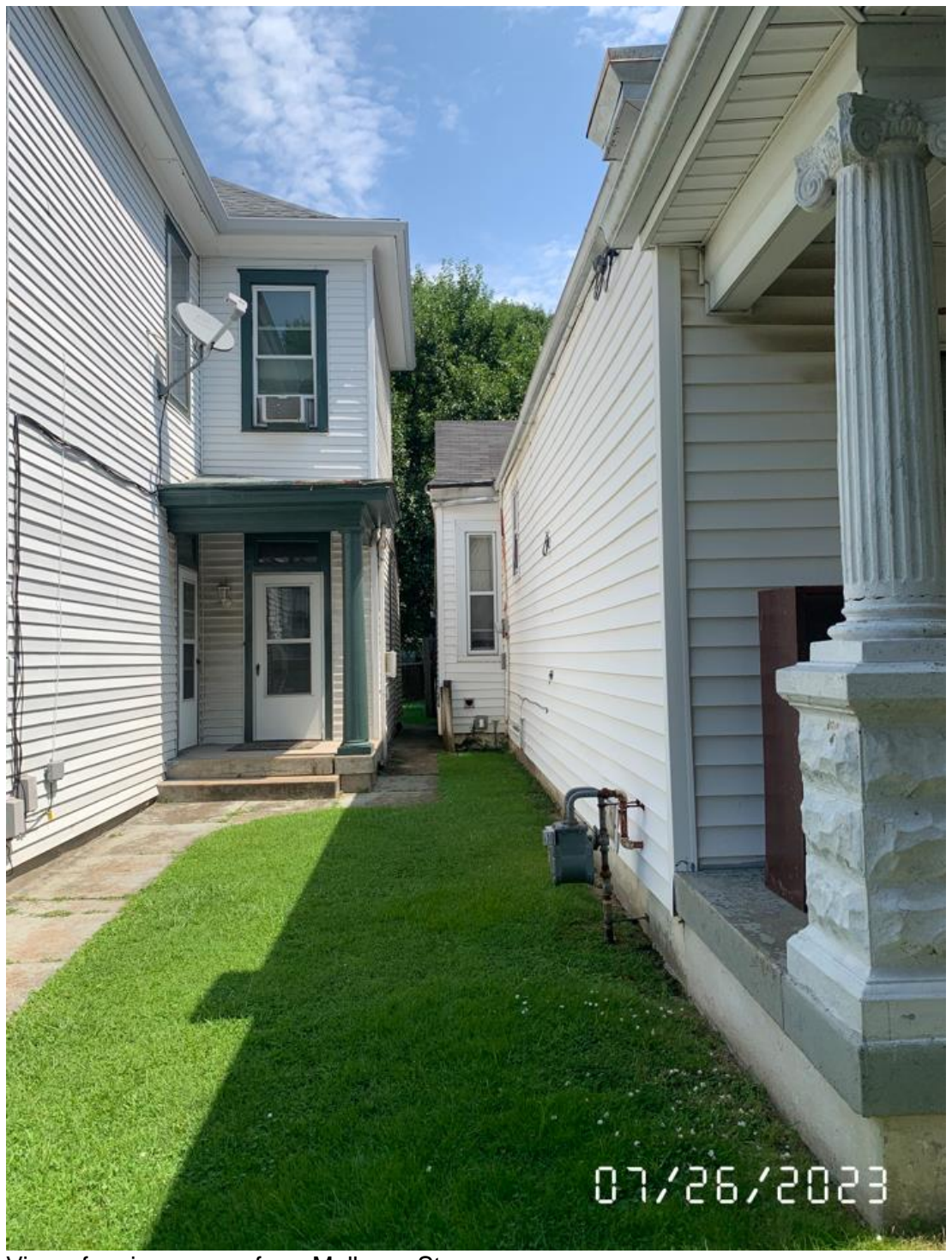
View of variance area from Mulberry St.