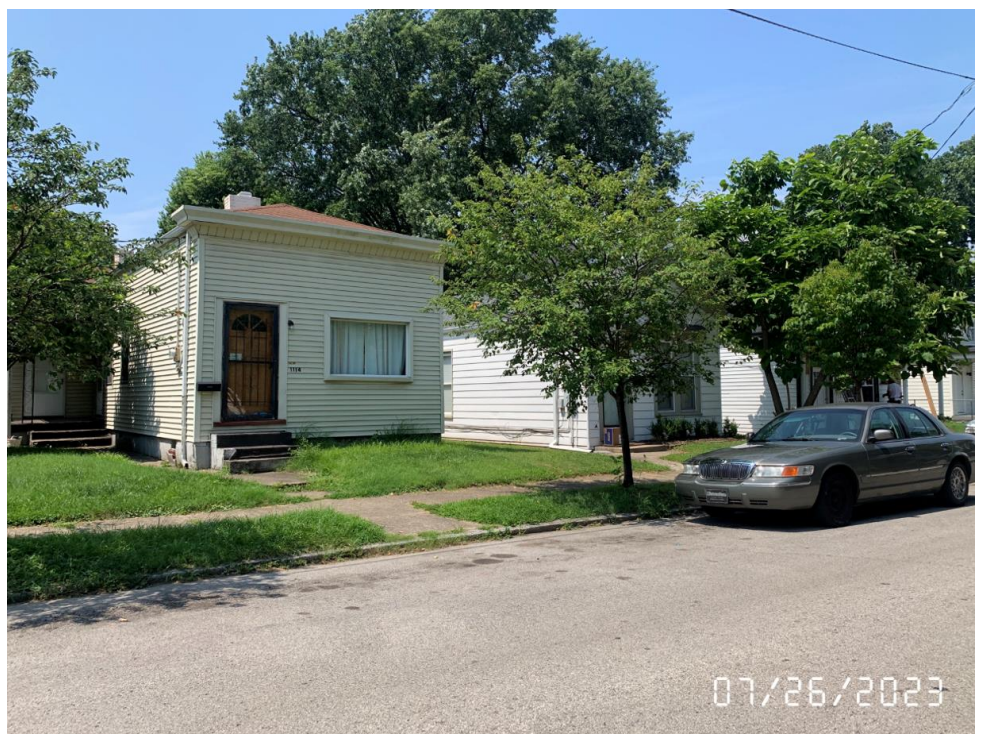
Across the street from subject property