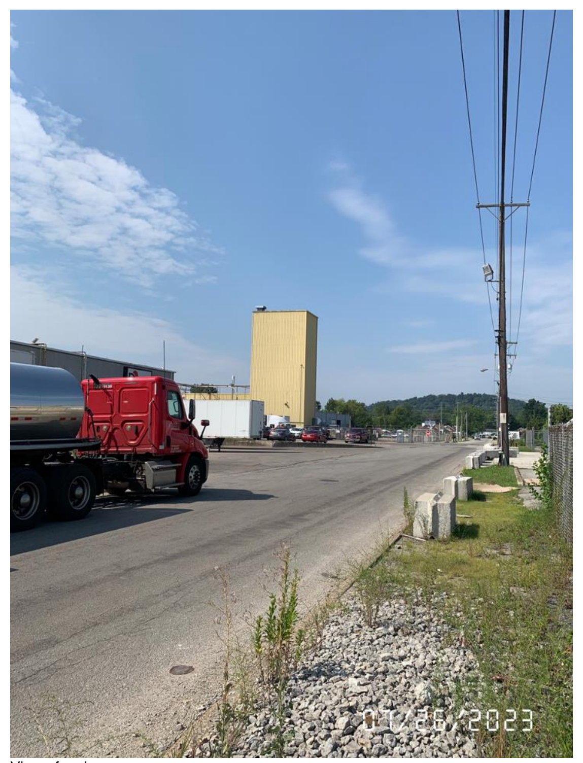
View of variance area.