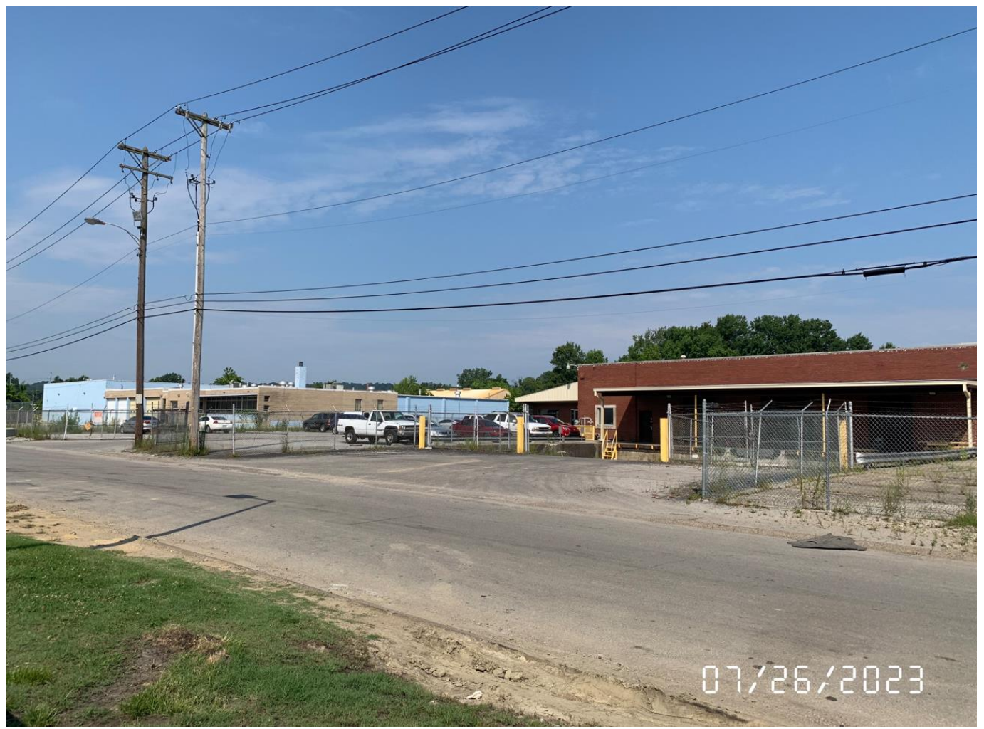
Across Kenjoy Drive.