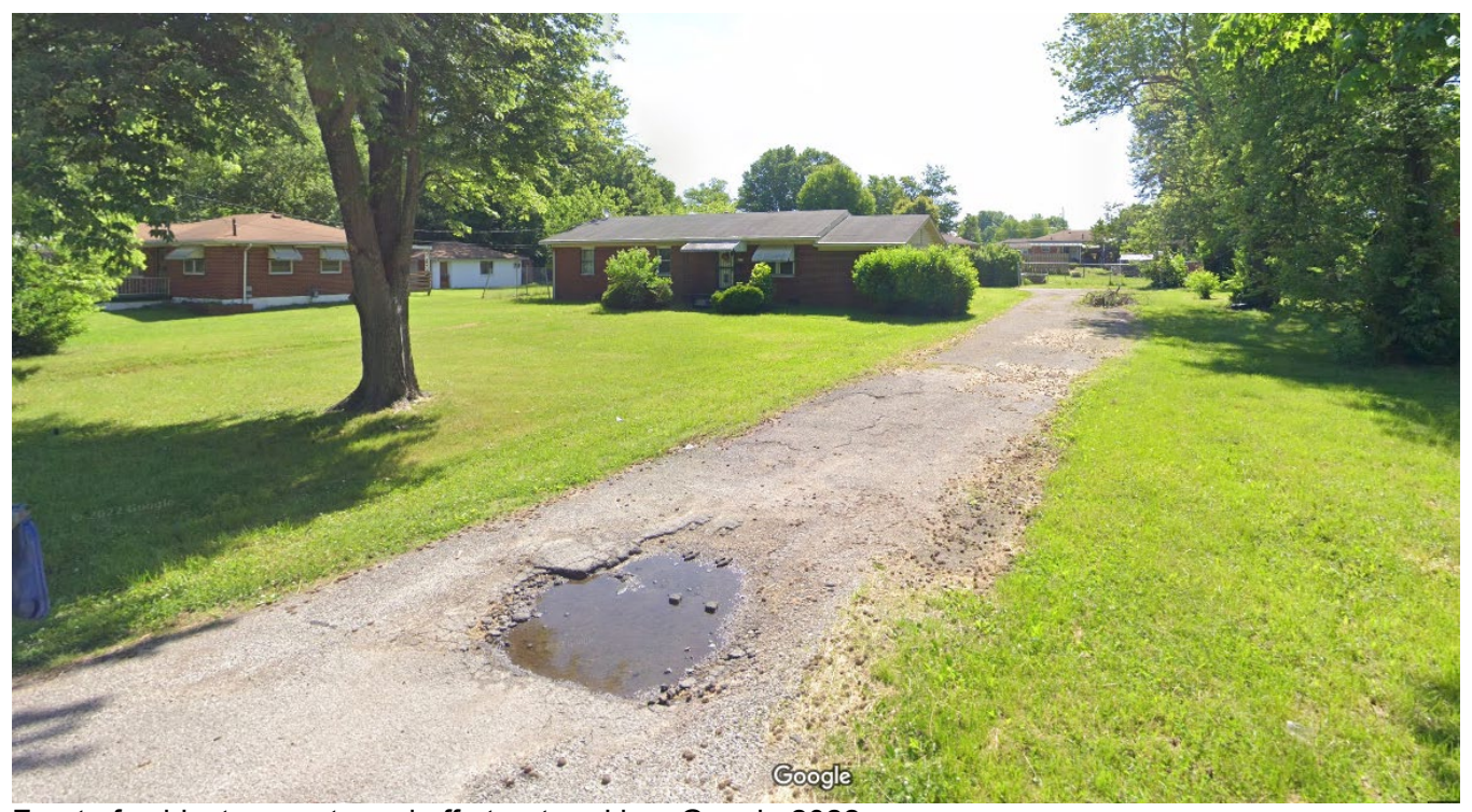
Front of subject property and off-street parking, Google 2022.