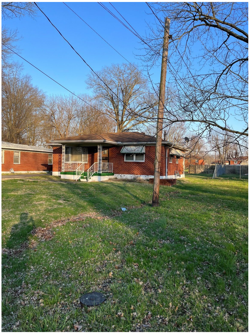
Property to the left.