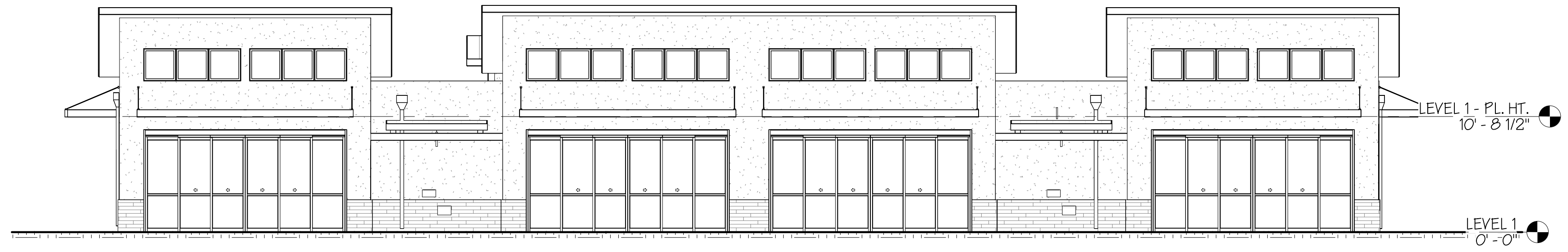
2 REAR ELEVATION- PRES 1/8" = 1'-0"