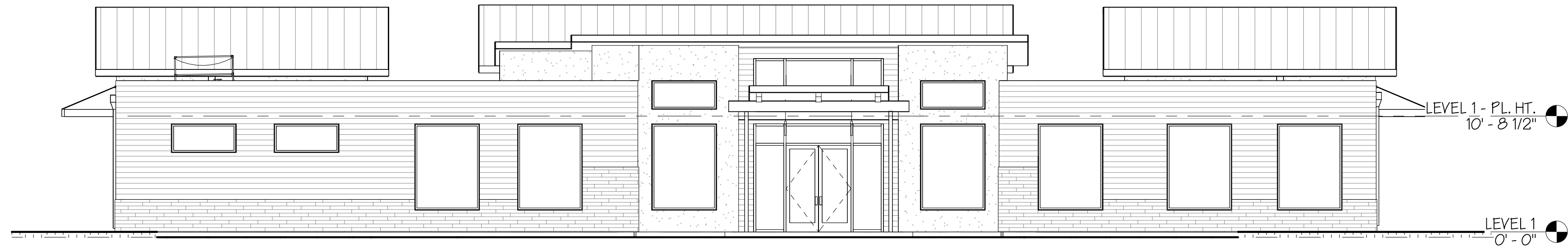
1 FRONT ELEVATION- PRES 1/8" = 1'-0"