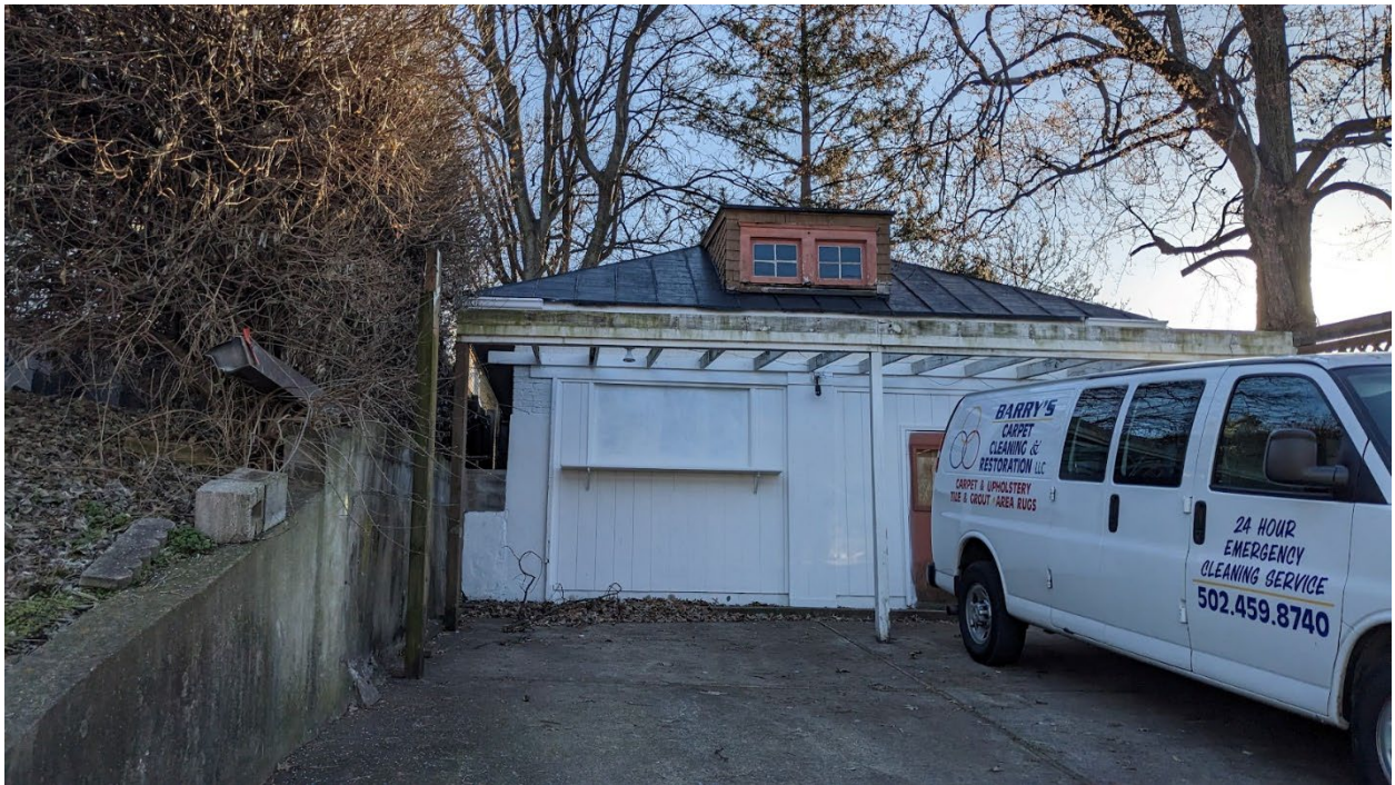
Garage, view from Brownsboro Rd.