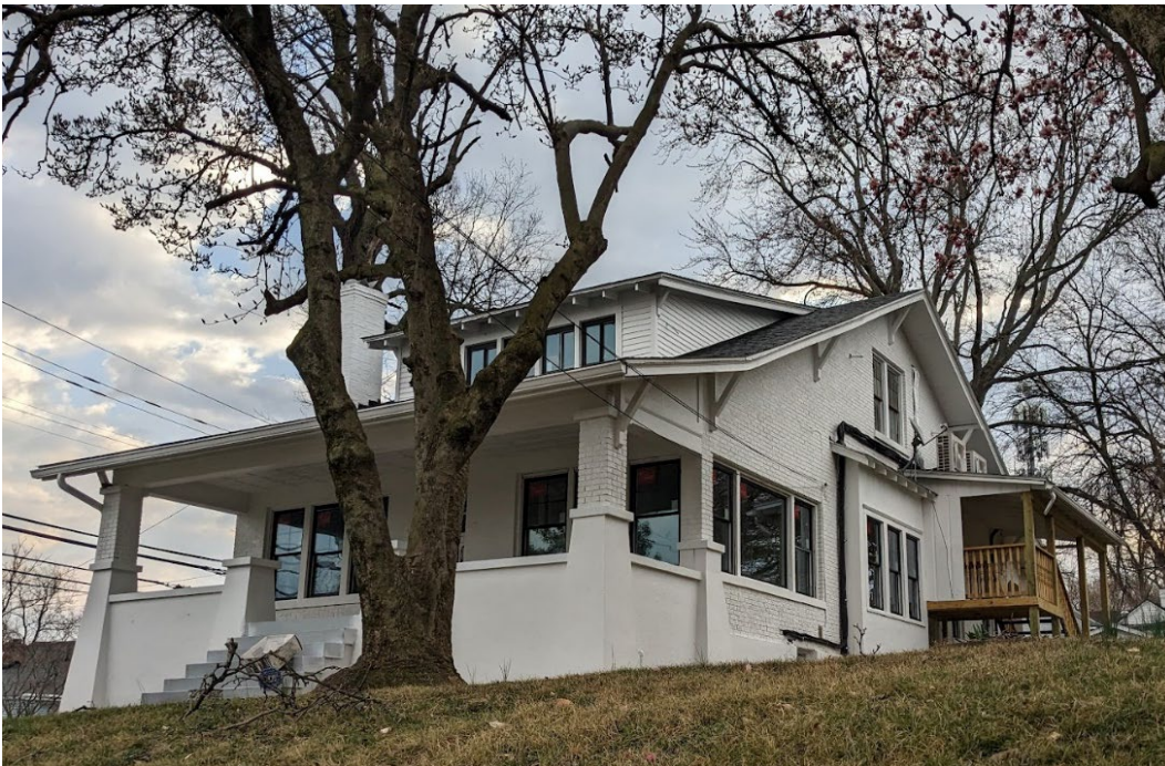
Front (west) and Side (south) Façades