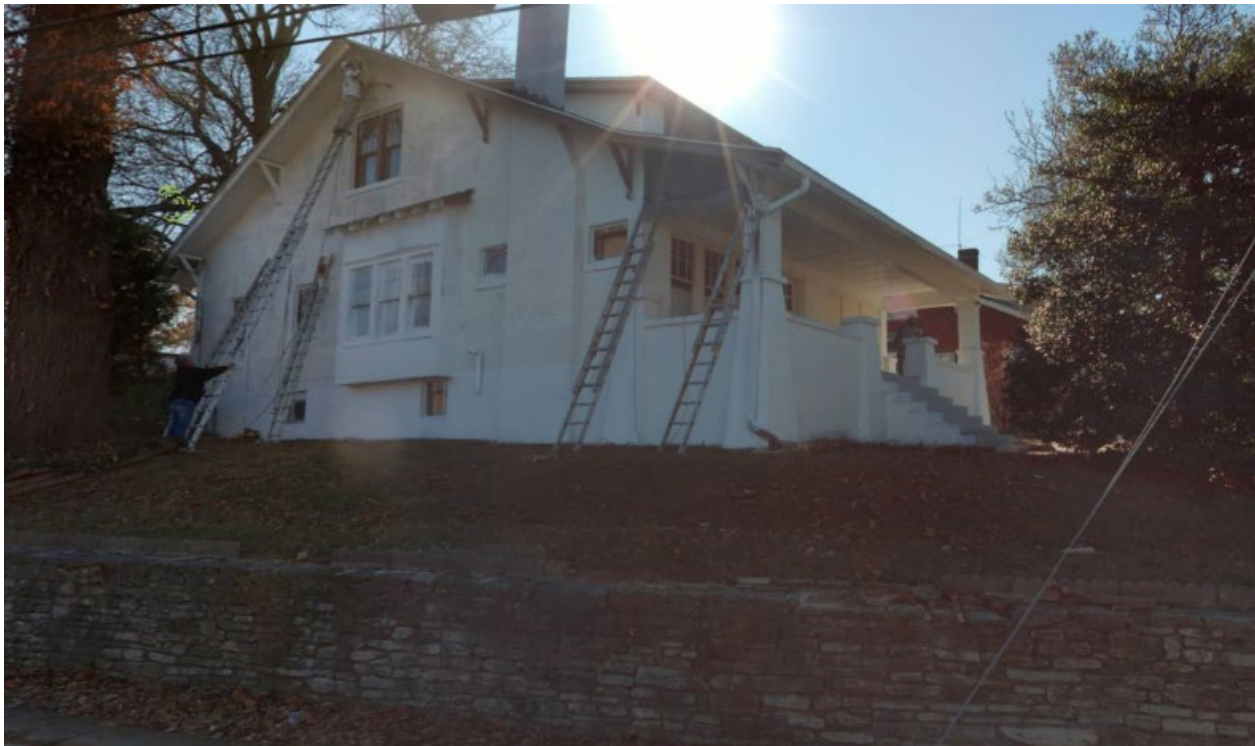
Jefferson County PVA Website, photo from 11/22/22