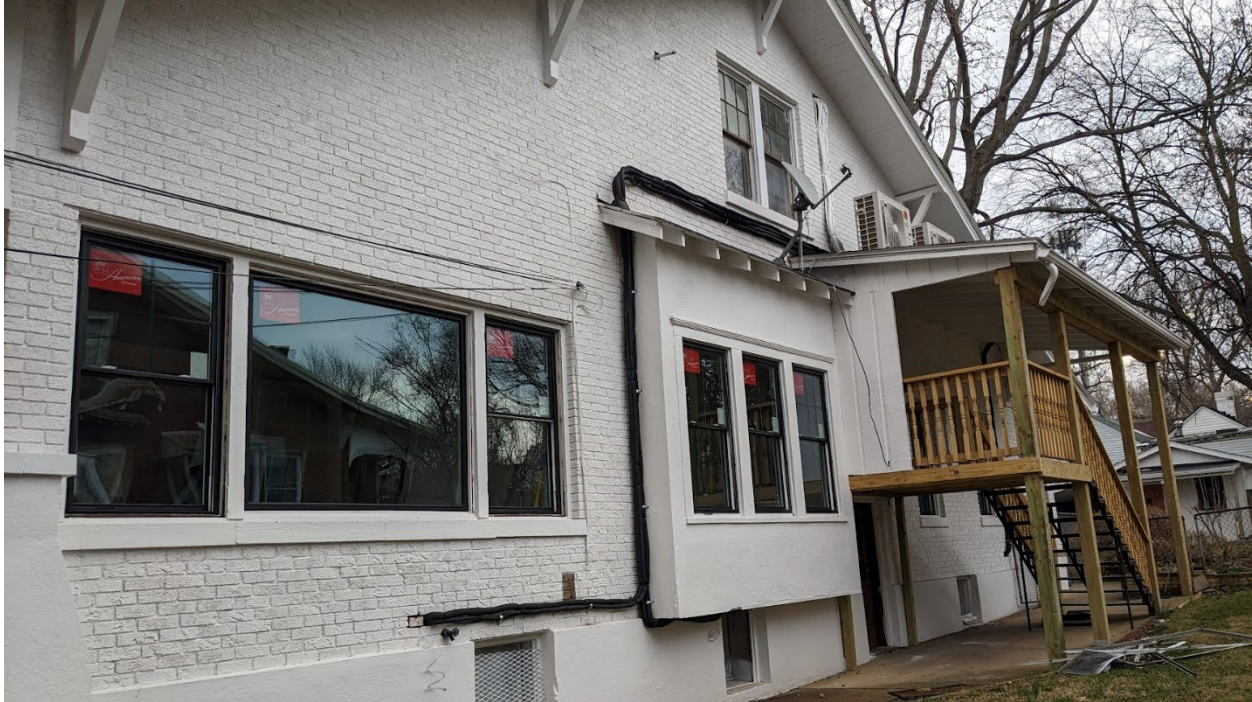
South Side Facade