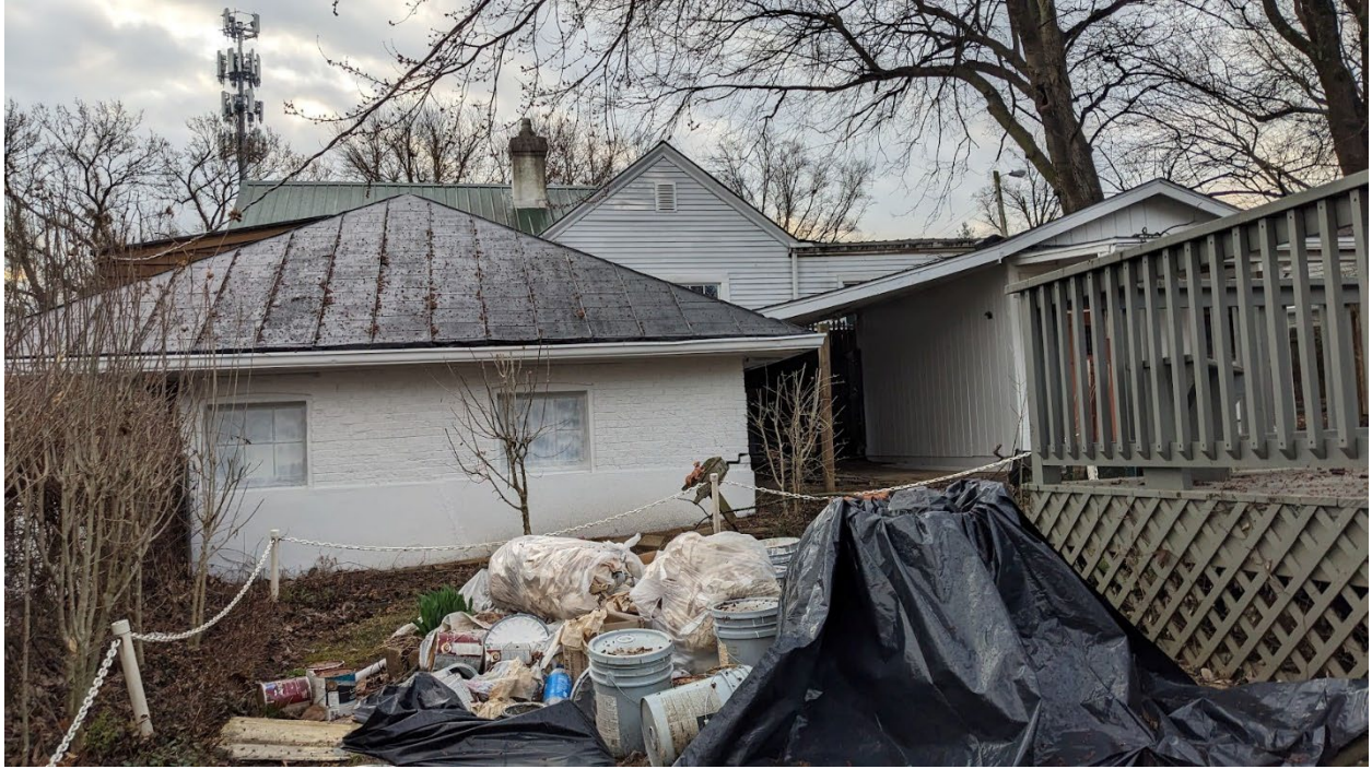
Garage, view from backyard