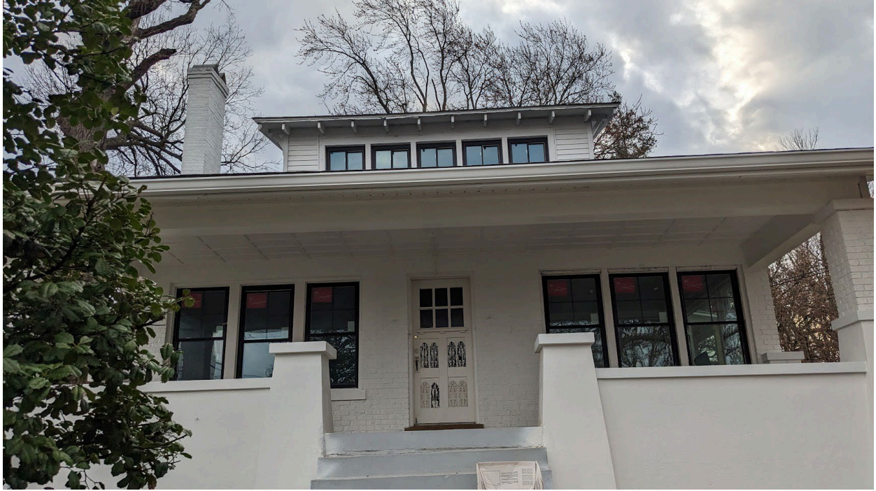
Front Façade (Pope St.)