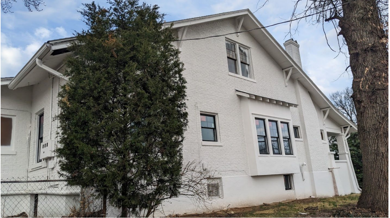
North Façade (Brownsboro Rd.)