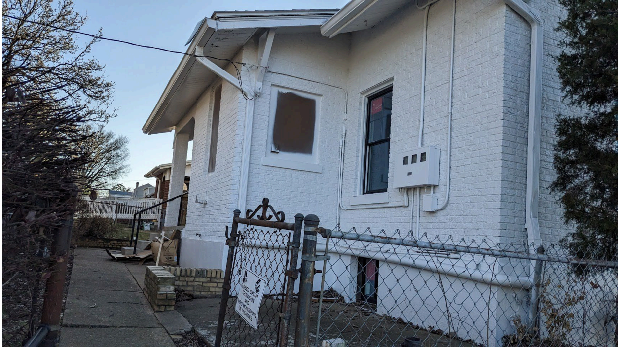
East Rear Façade