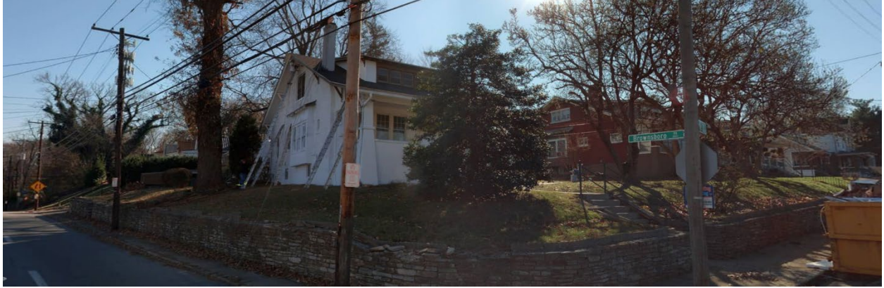
Jefferson County PVA Website, photo from 11/22/22